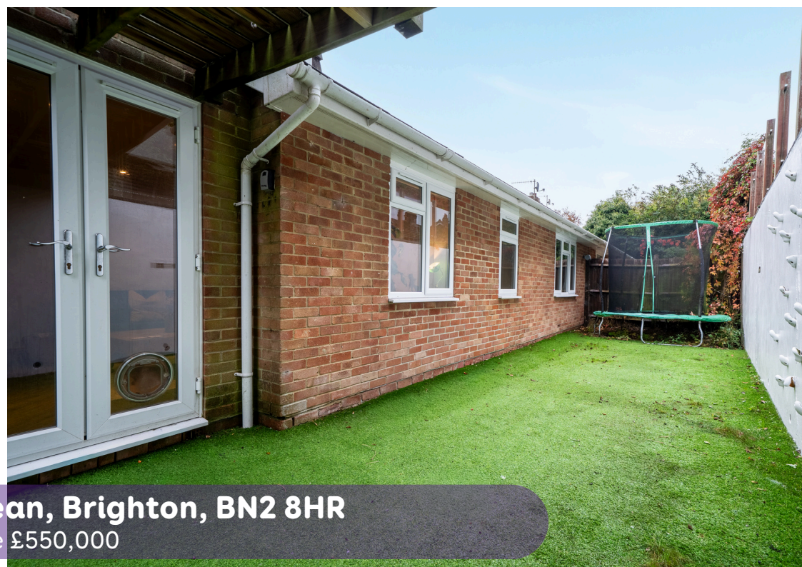
Westfield Rise, Saltdean, Brighton, BN2 8HR Asking Price £550,000