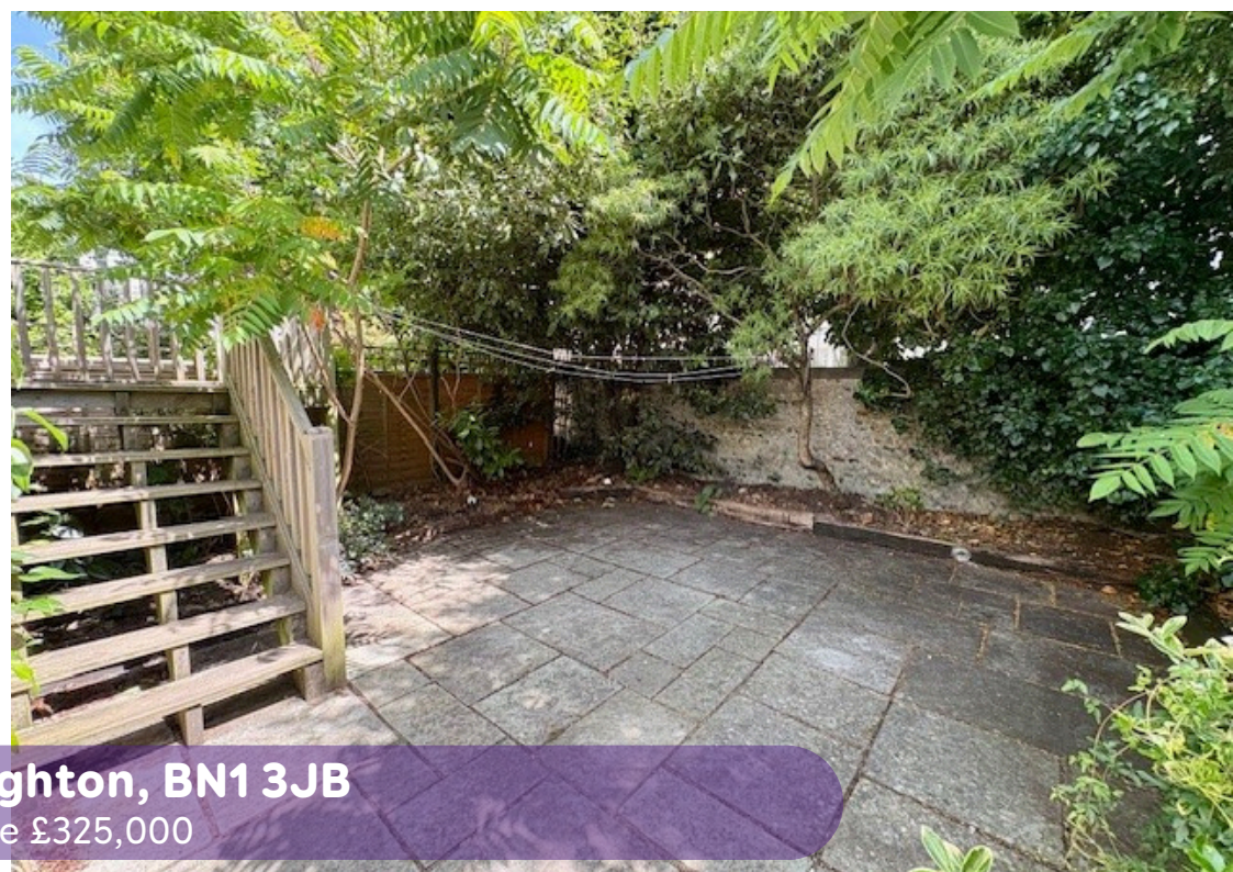
Dyke Road, Brighton, BN1 3JB Asking Price £325,000