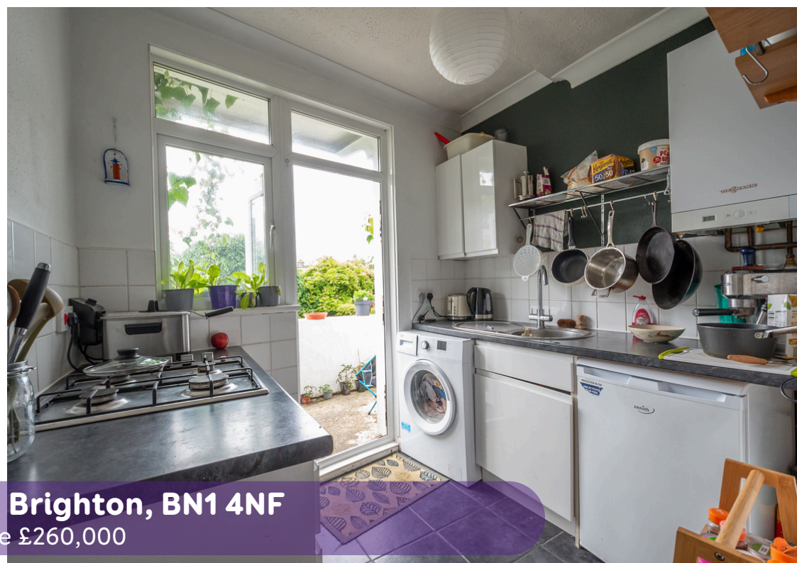
Shaftesbury Road, Brighton, BN1 4NF Asking Price £260,000