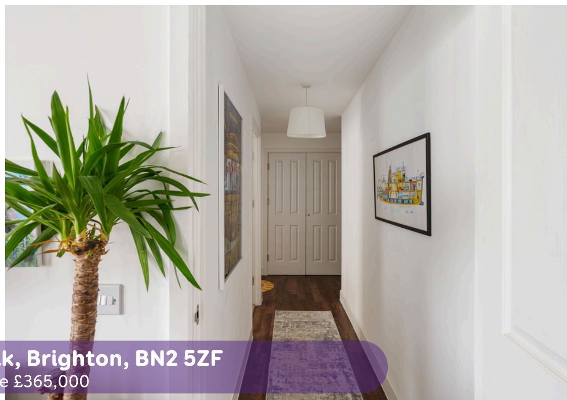
Sirius, The Boardwalk, Brighton, BN2 5ZF Asking Price £365,000