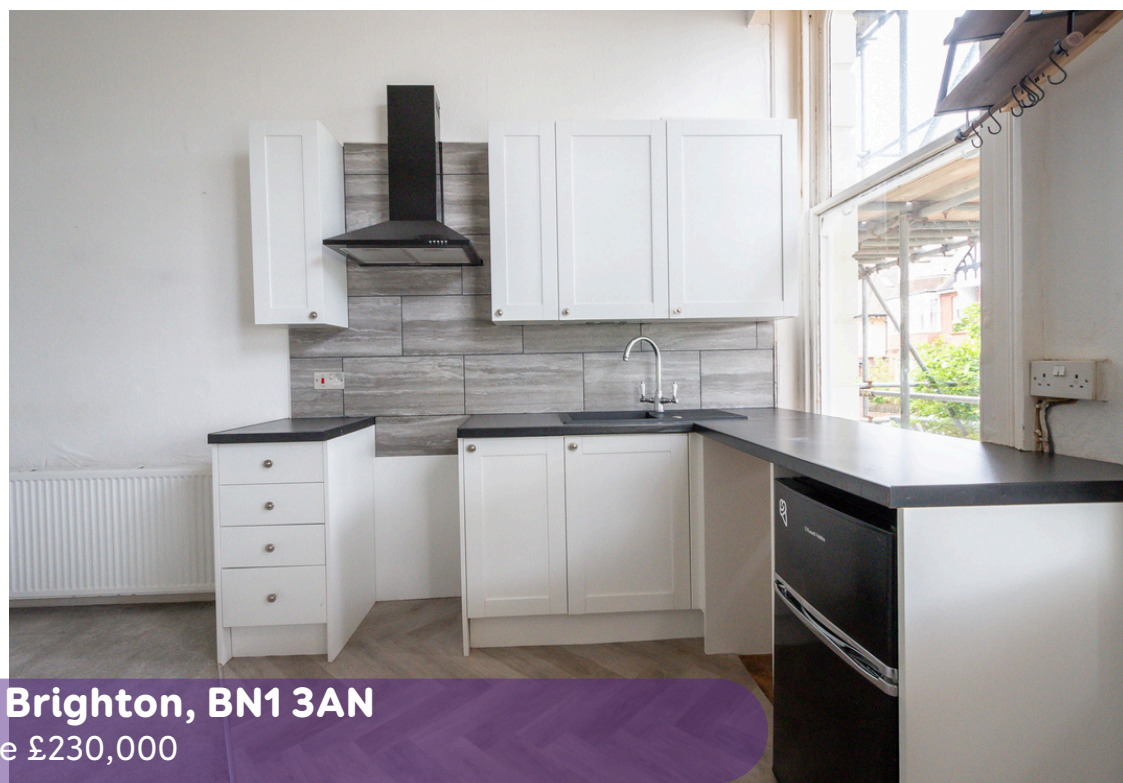
Denmark Terrace, Brighton, BN1 3AN Asking Price £230,000