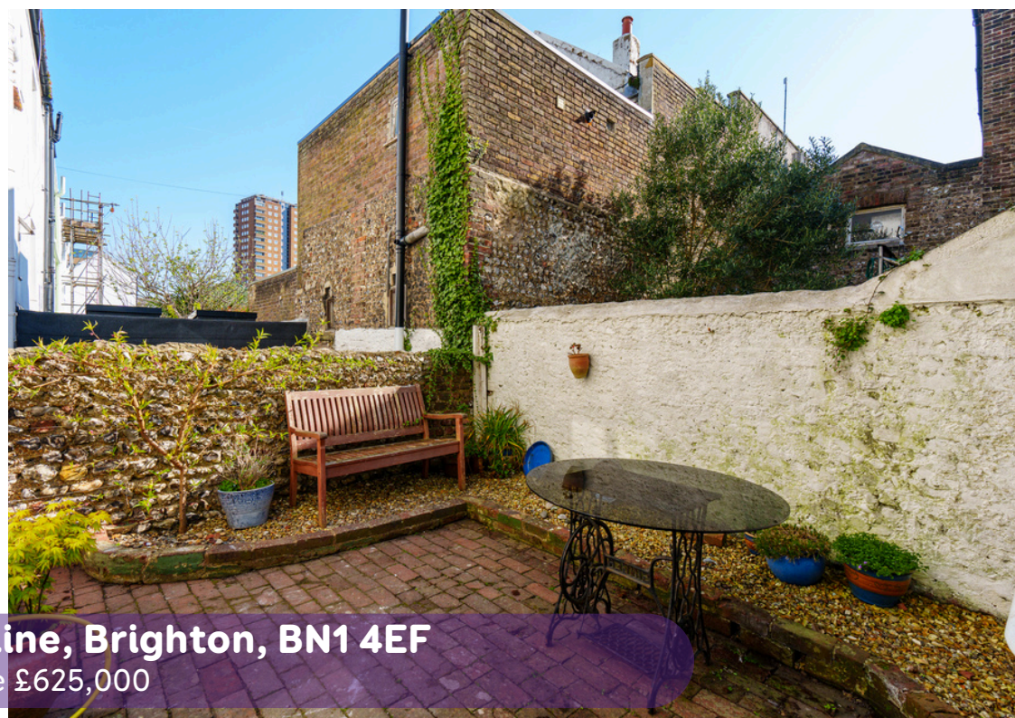
Kemp Street, North Laine, Brighton, BN1 4EF Asking Price £625,000