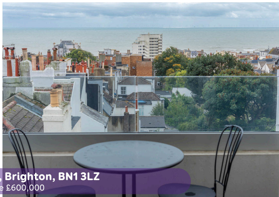
Norfolk Terrace, Brighton, BN1 3LZ Asking Price £600,000