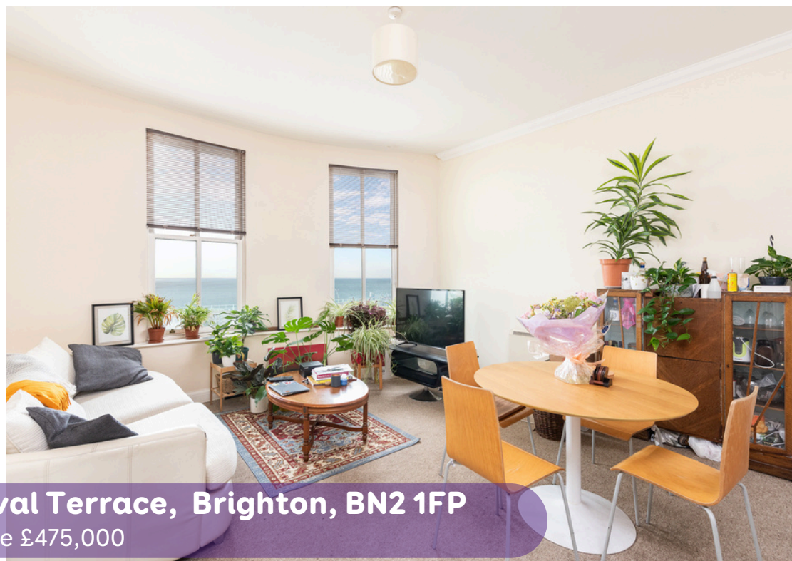
Percival Mansions, Percival Terrace, Brighton, BN2 1FP Asking Price £475,000