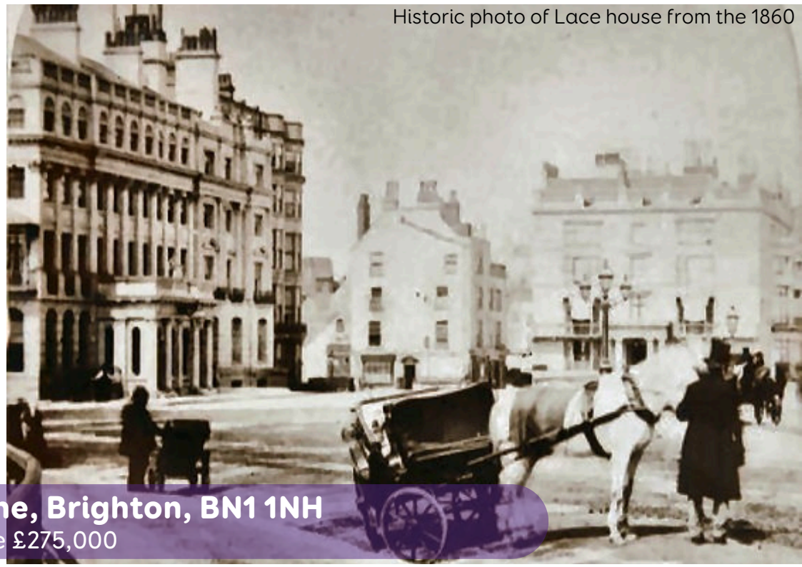
Historic photo of Lace house from the 1860