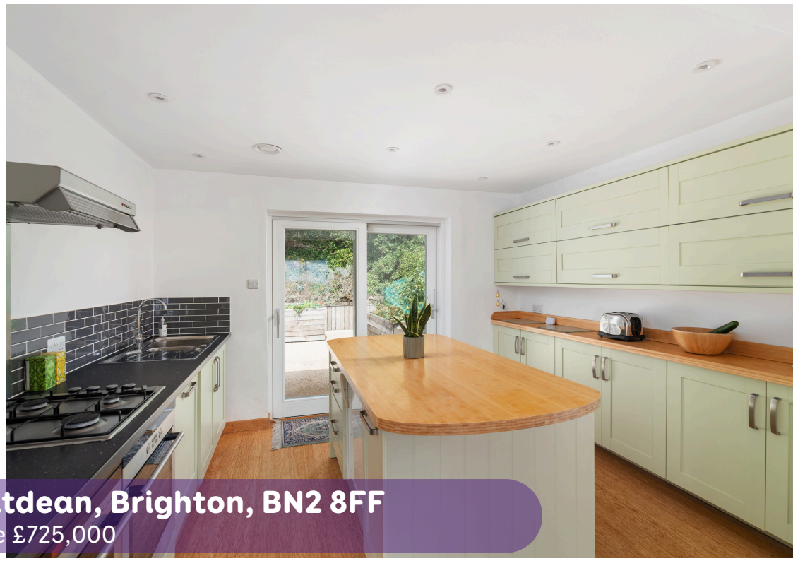
26 Bishopstone Drive, Saltdean, Brighton, BN2 8FF Asking Price £725,000