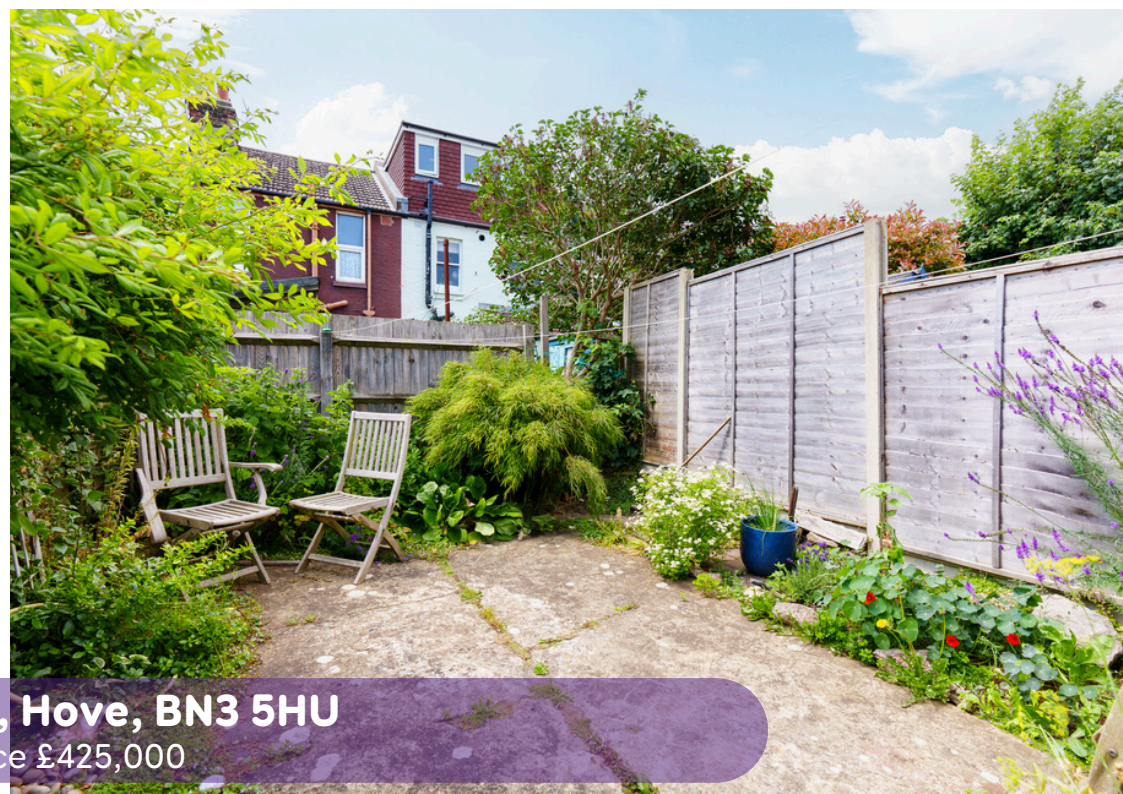
Grange Road, Hove, BN3 5HU Asking Price £425,000