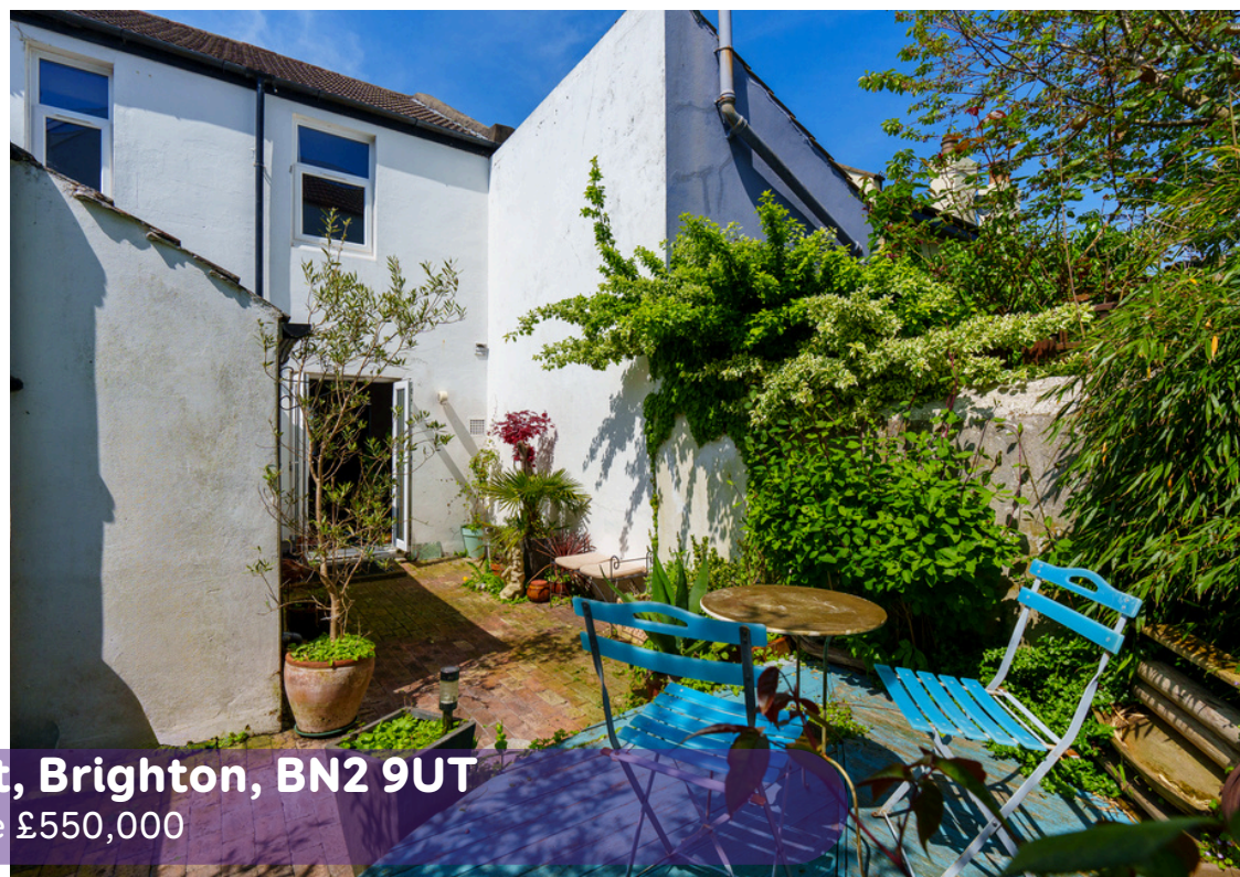
Southampton Street, Brighton, BN2 9UT Asking Price £550,000