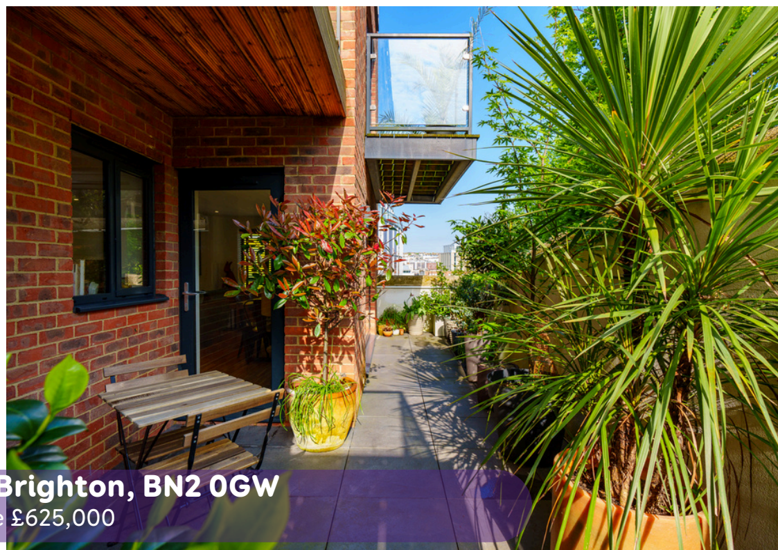
Kempton House, Brighton, BN2 0GW Asking Price £625,000