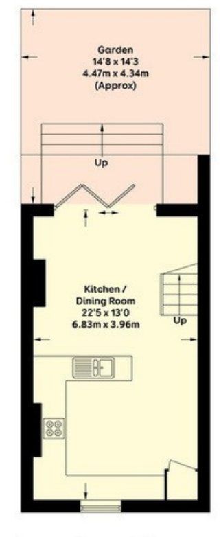
Lower Ground Floor 301 sq ft / 28.0 sq m