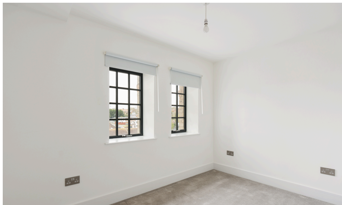
The Brewery 1881, 30 South Street, Portslade, BN41 2AQ From £375,000