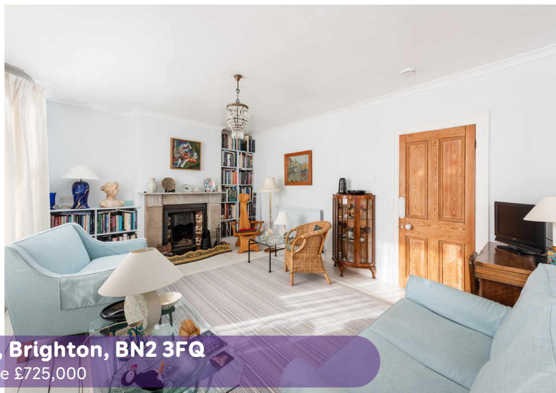
Roundhill Crescent, Brighton, BN2 3FQ Asking Price £725,000