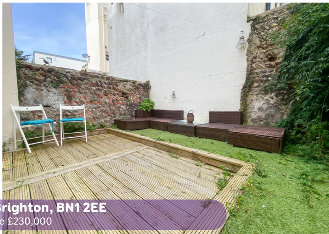
Russell Square, Brighton, BN1 2EE Asking Price £230,000