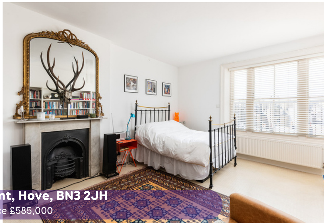
Adelaide Crescent, Hove, BN3 2JH Asking Price £585,000