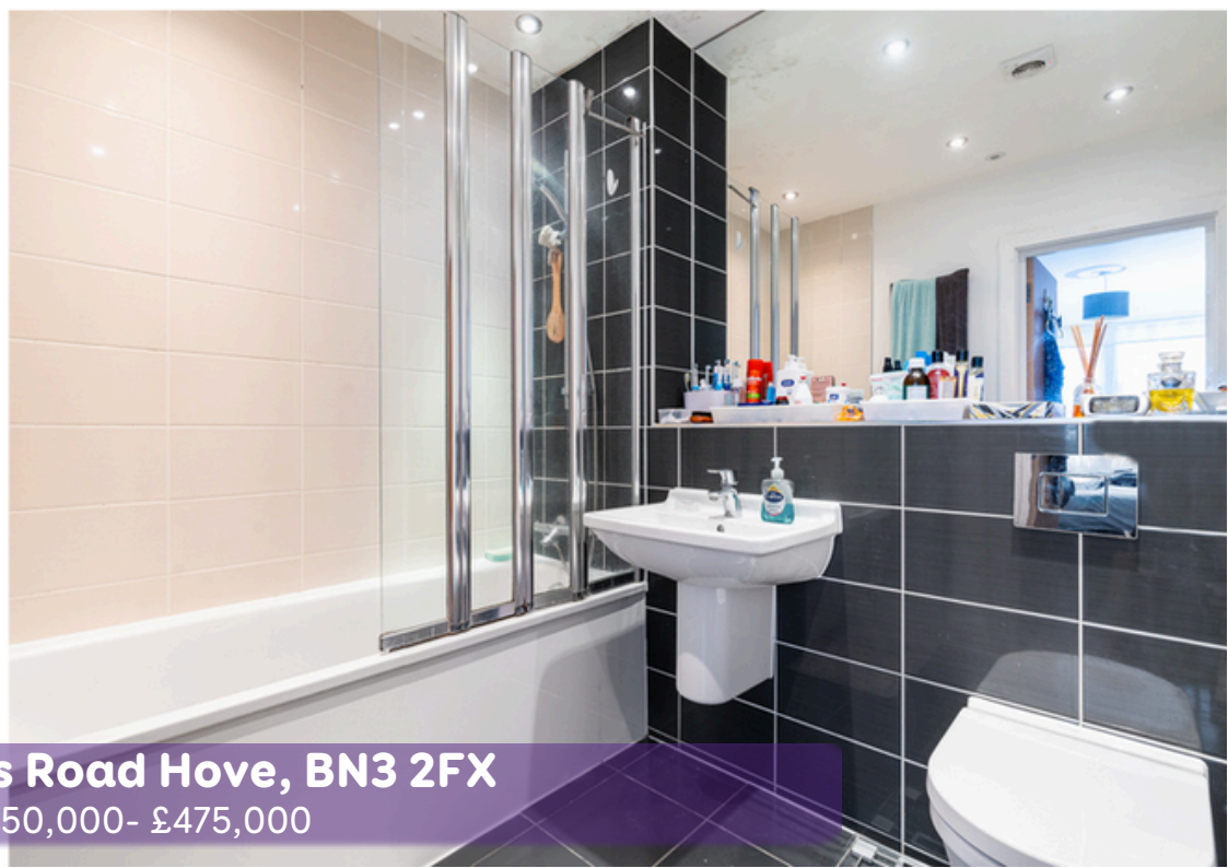
Beta House, St Johns Road Hove, BN3 2FX Guide Price Of £450,000- £475,000