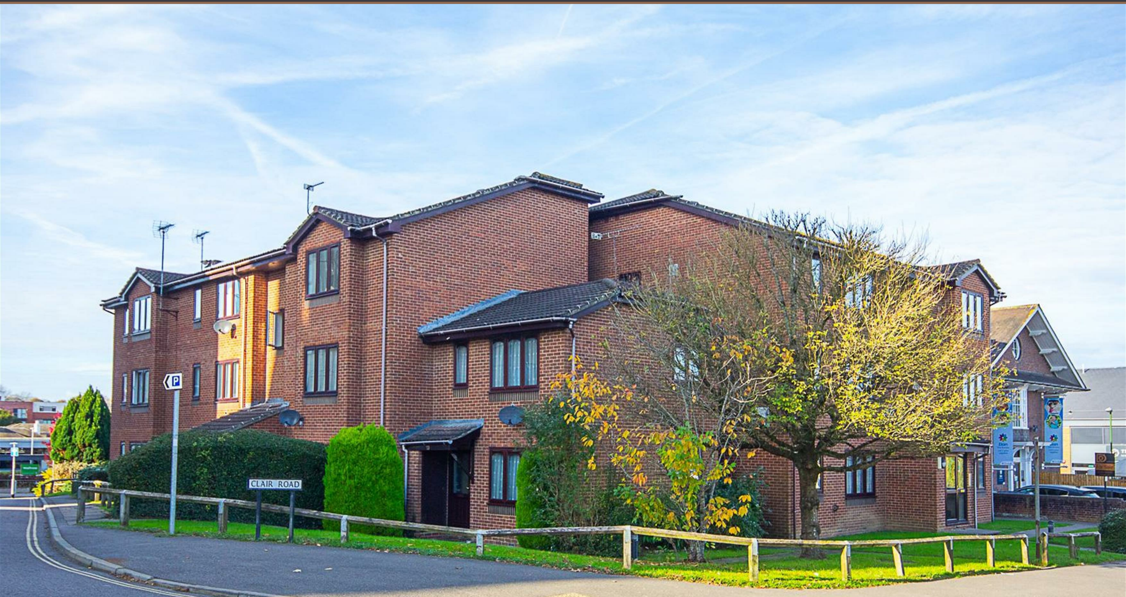
Clevelands, Haywards Heath, RH16 3BA