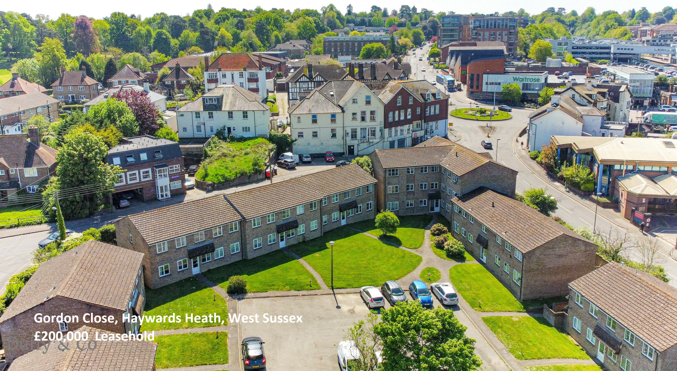
Gordon Close, Haywards Heath, West Sussex £200,000 Leasehold