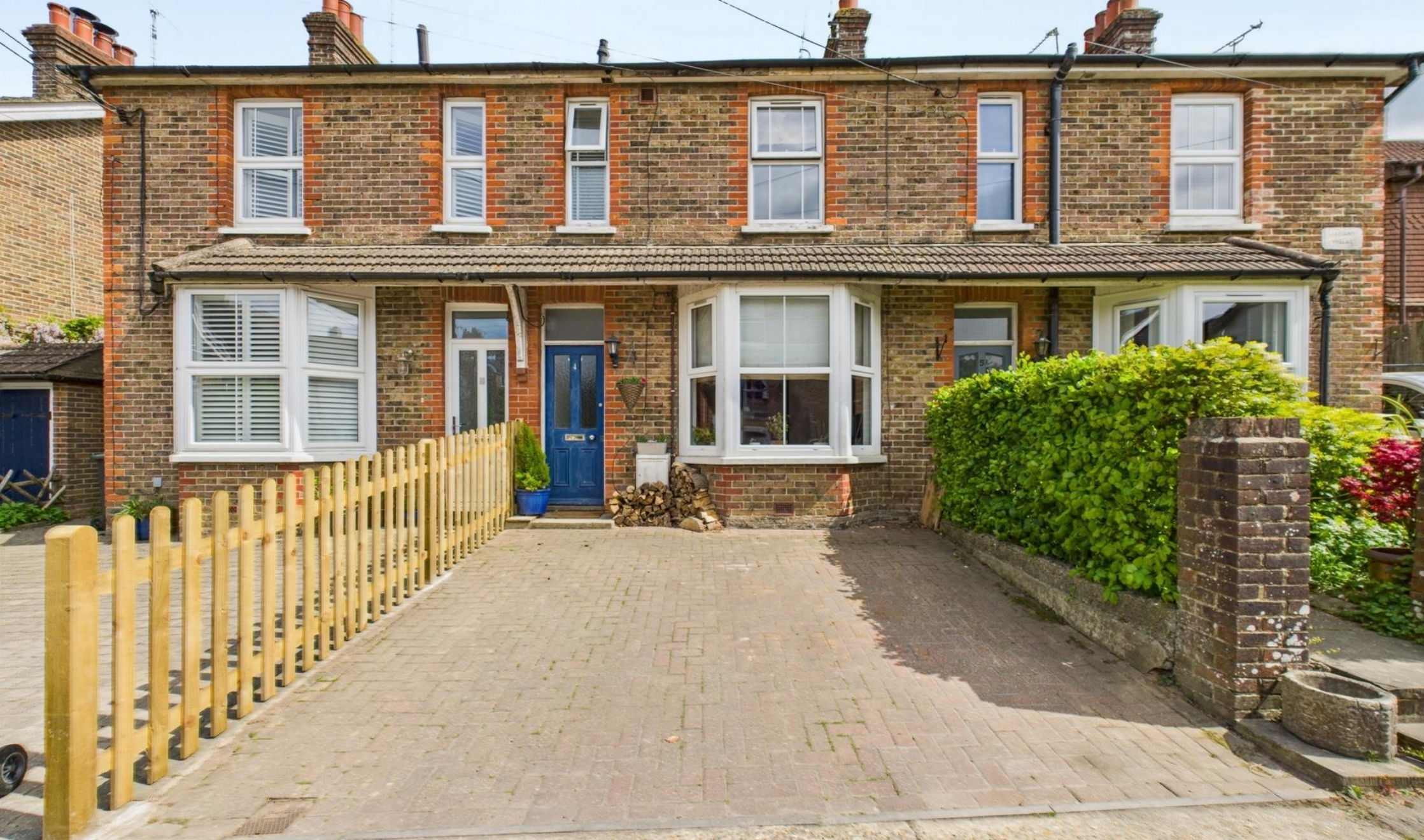
4 Albany Villas Horsgate Lane, Cuckfield, RH17 5AZ