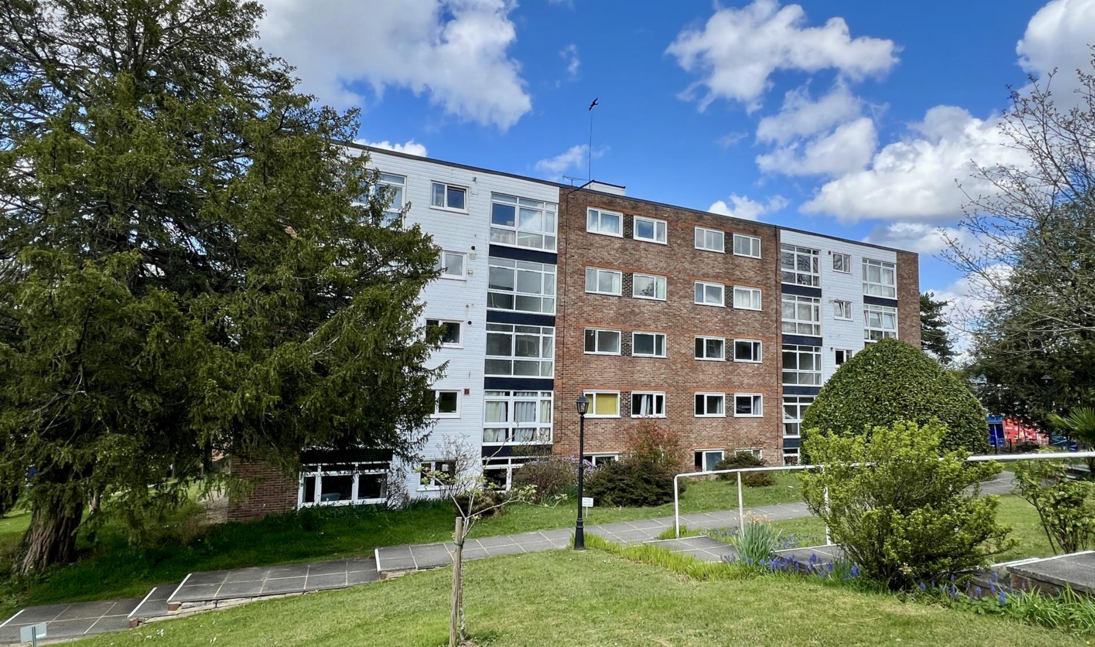
16 Kipling Court Winnals Park, Haywards Heath, RH16 1EX