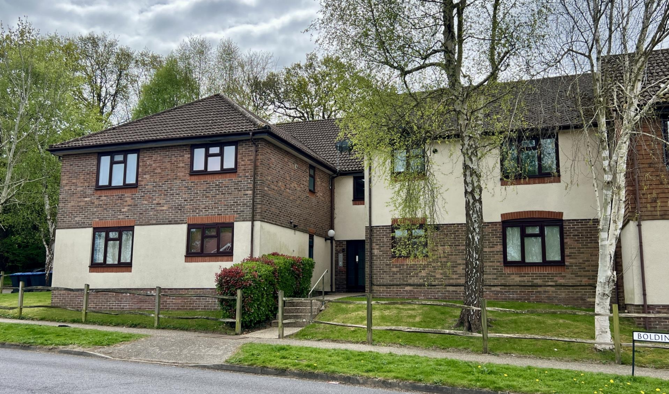
9 Kilnarn Court Kilnarn Way, Haywards Heath, RH16 4SE