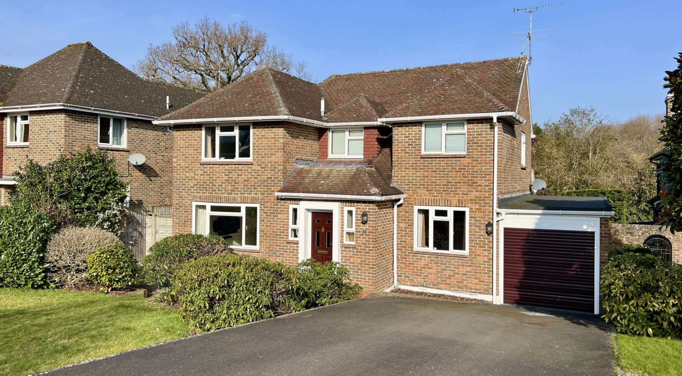
8 Gatesmead Haywards Heath, RH16 1SN