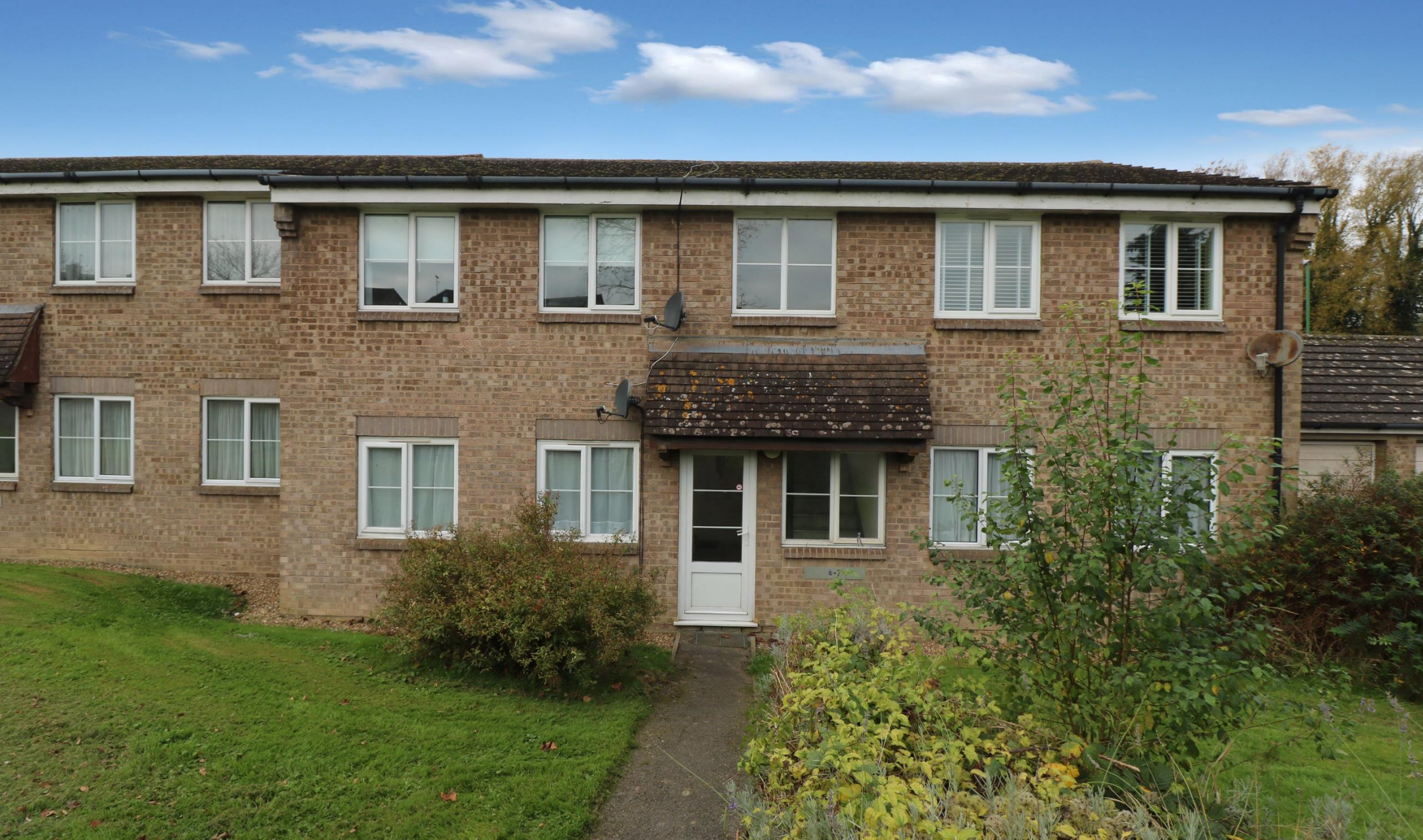
5 Gordon Close Haywards Heath, RH16 1ER