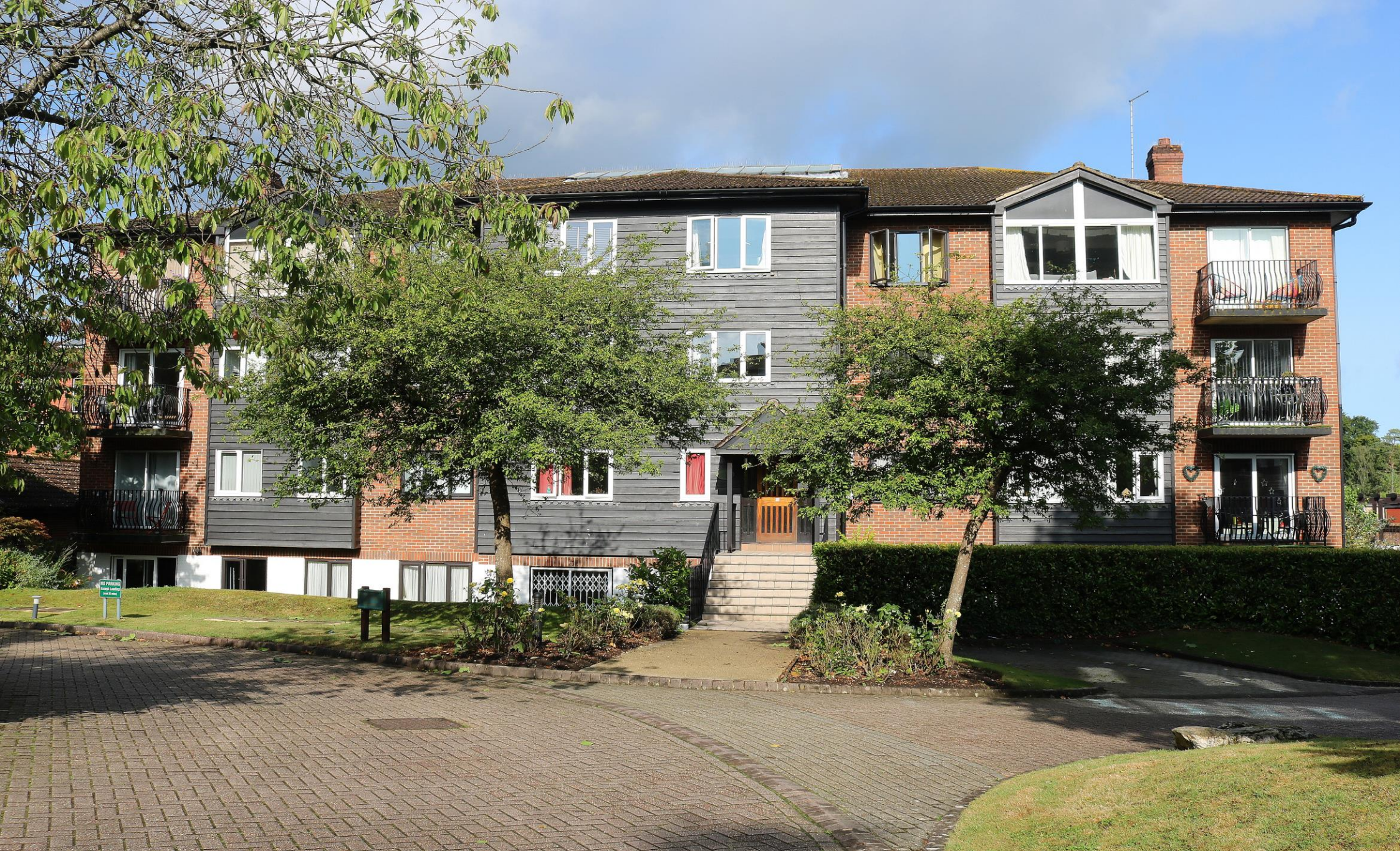
1 Laurel House Great Heathmead, Haywards Heath, West Sussex. RH16 1FE