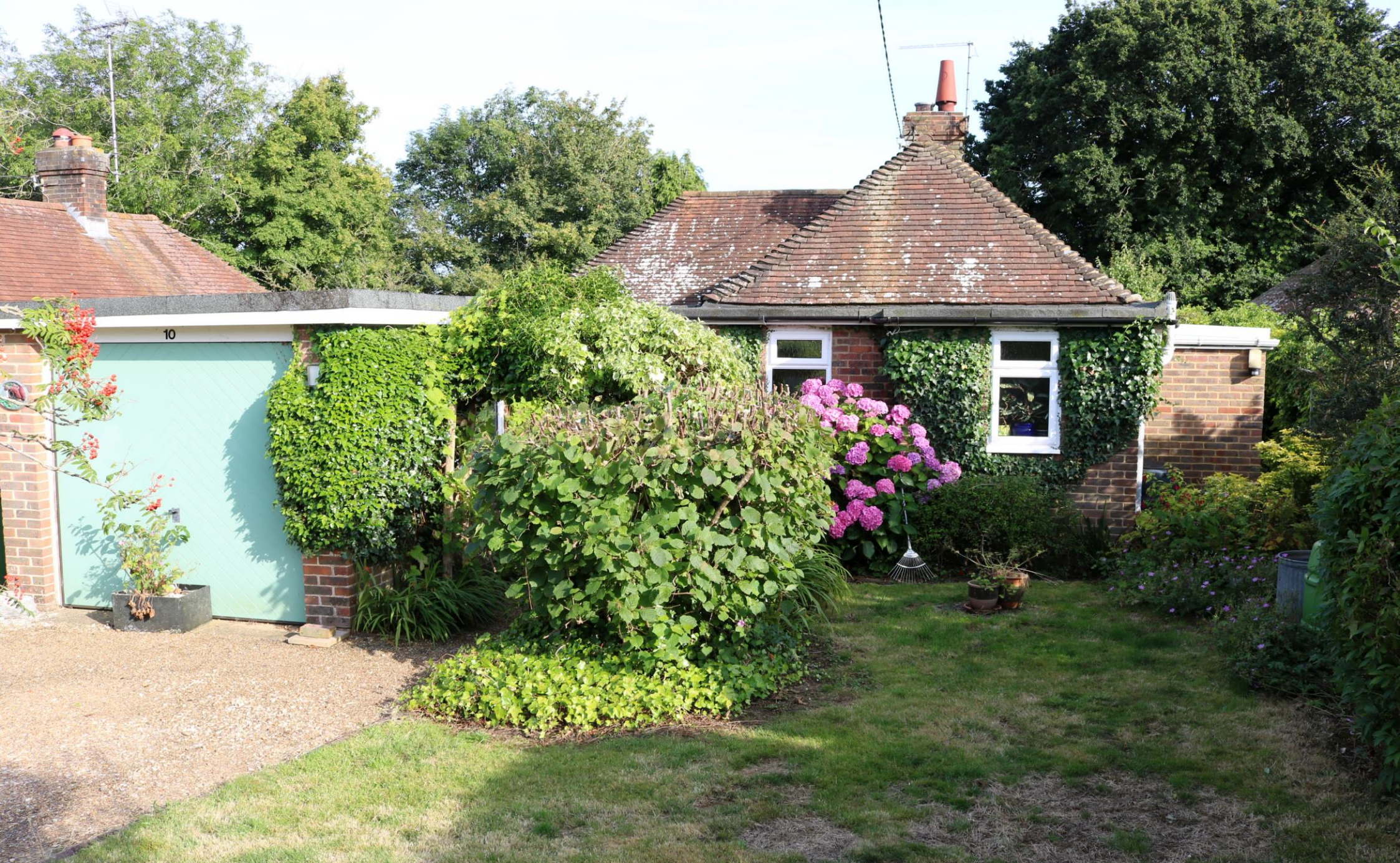
10 Barnfield Plumpton Green, East Sussex. BN7 3ED