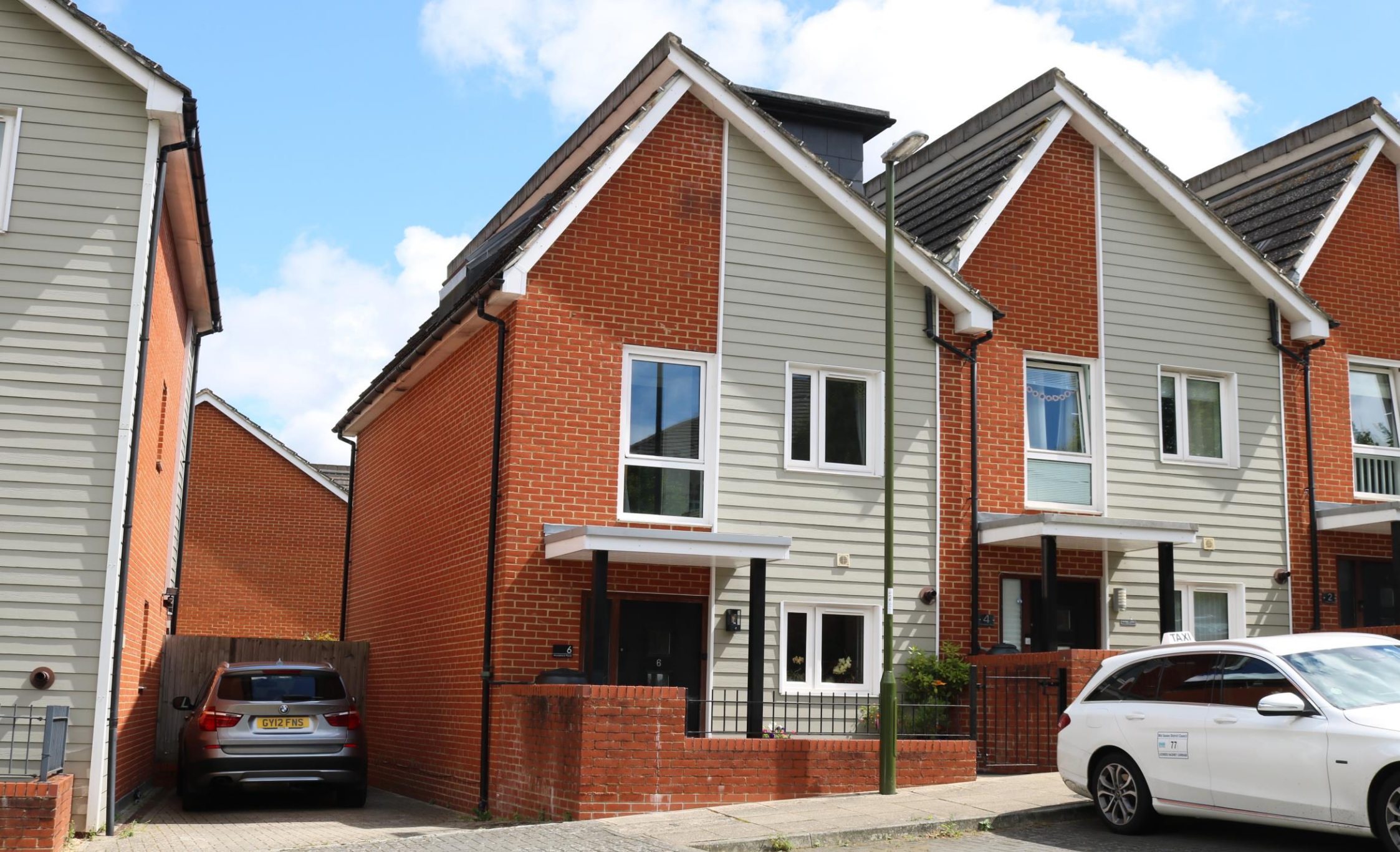
6 Woodstock Place Haywards Heath, RH16 3UJ