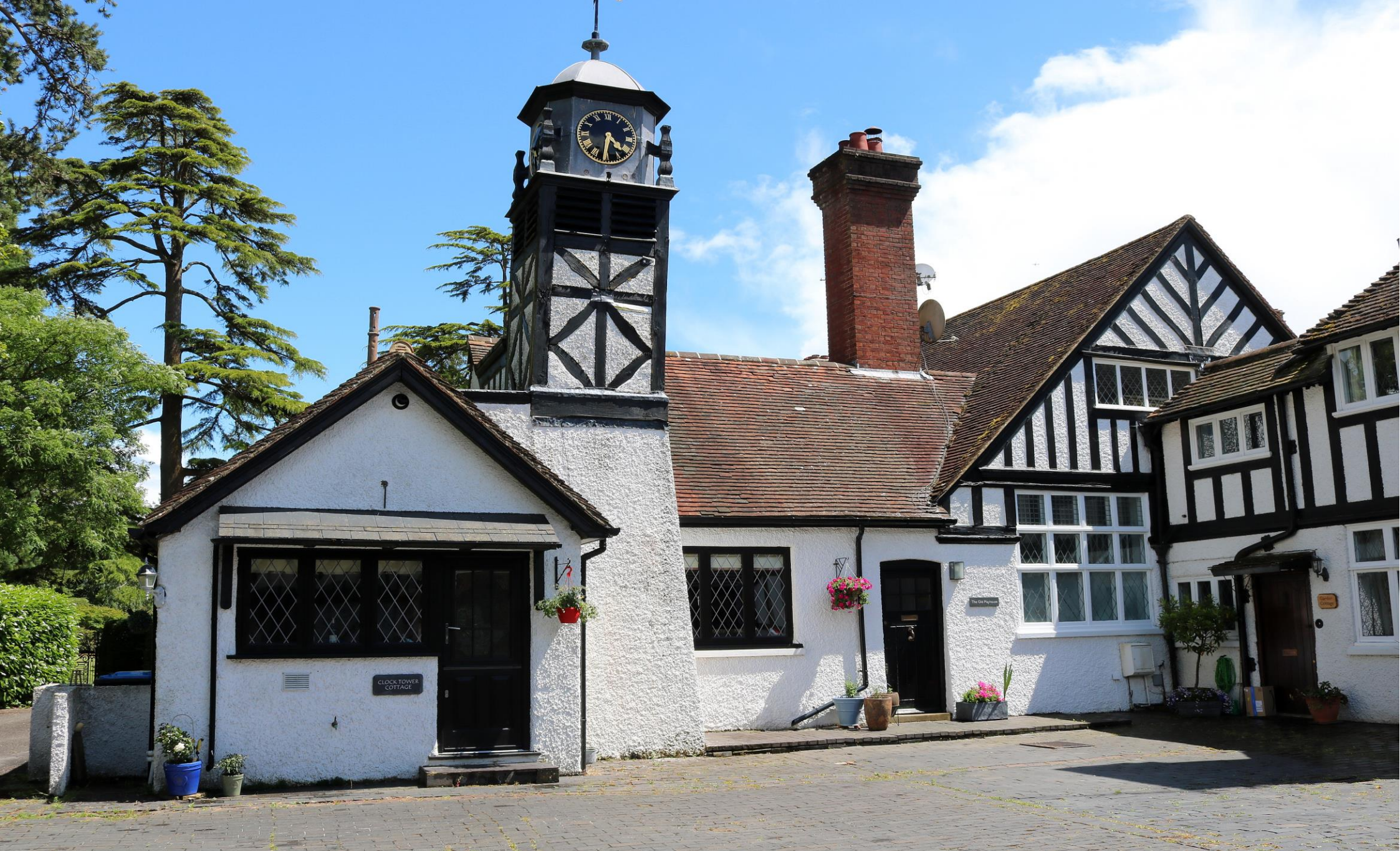
The Old Playhouse Cuckfield Lane, Warminglid, RH17 5SP.