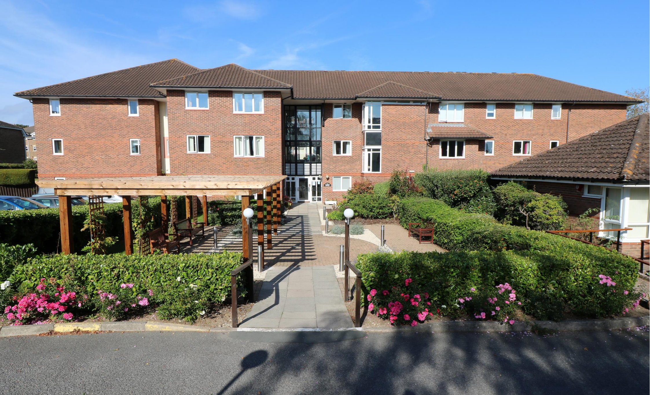
18 Clover Court Church Road, Haywards Heath. RH16 3UF