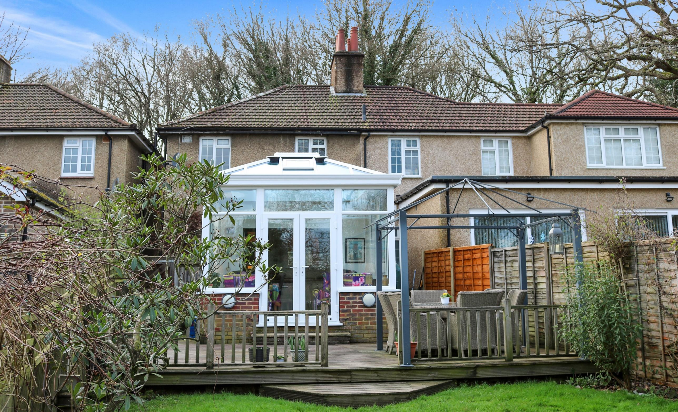
Railway Cottages Lindfield Road, Ardingly, West Sussex, RH17 6