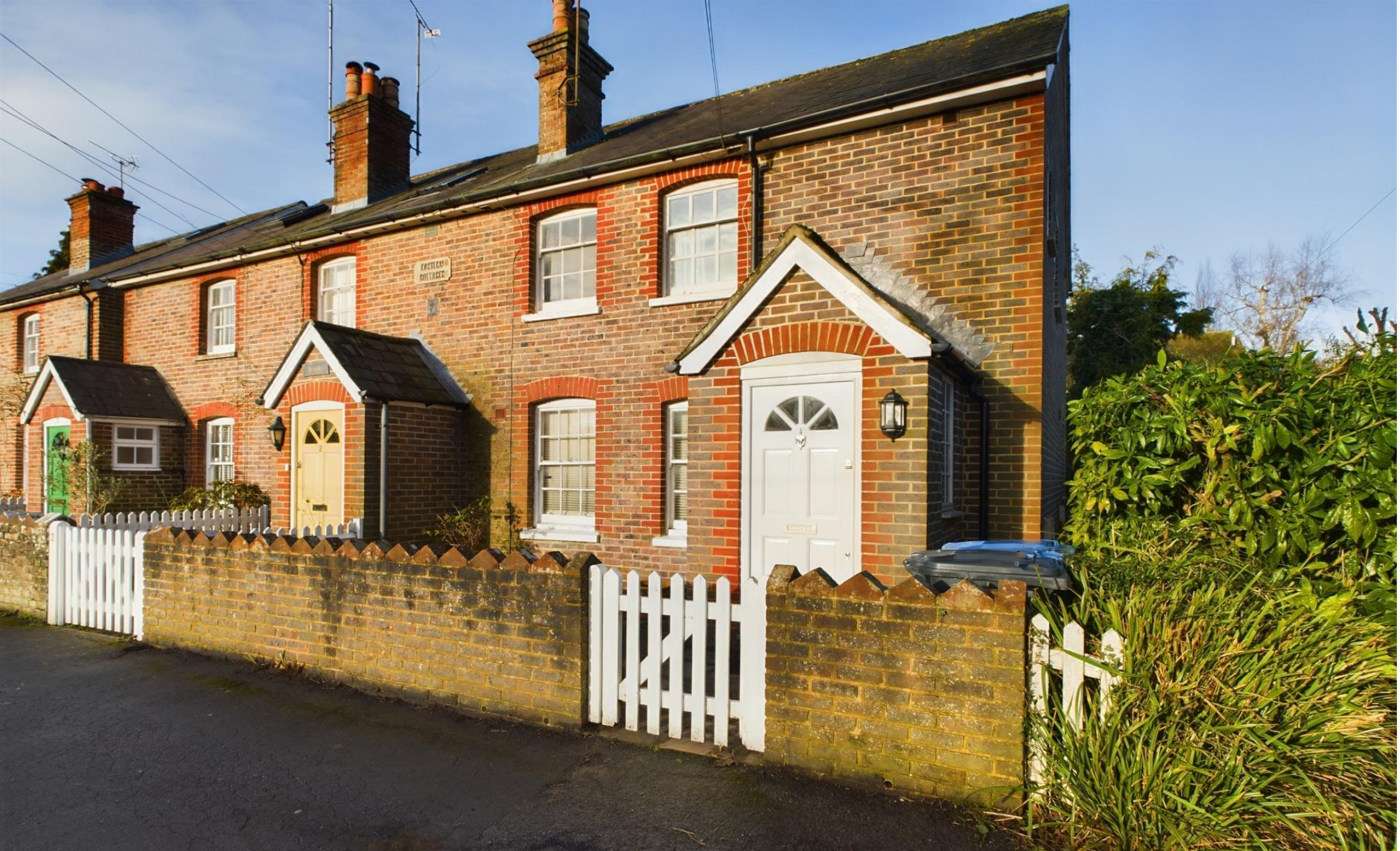
Eastern Cottages Lewes Road, Lindfield, West Sussex, RH16 2