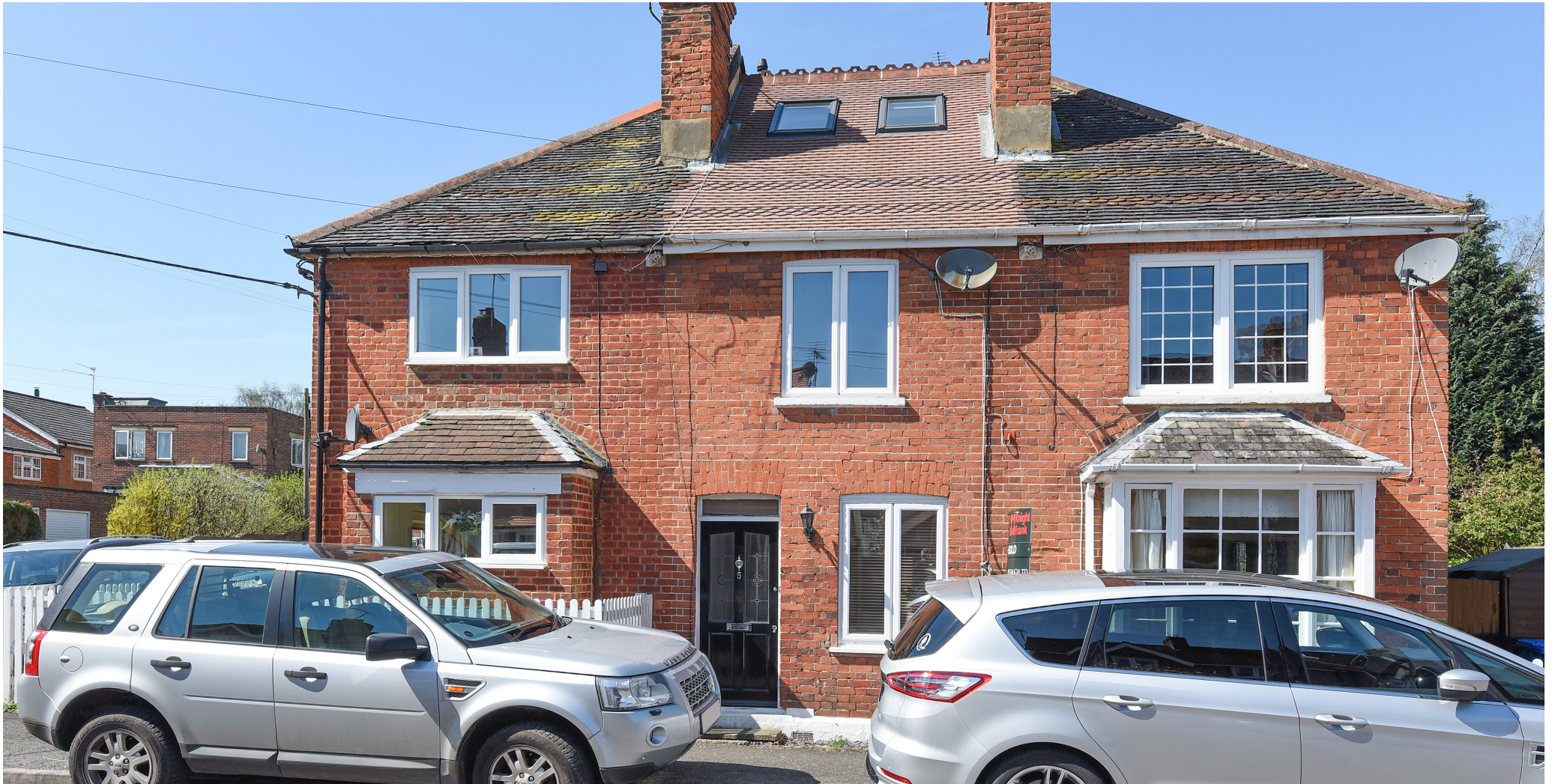
SOUTH ASCOT, Ascot SL5