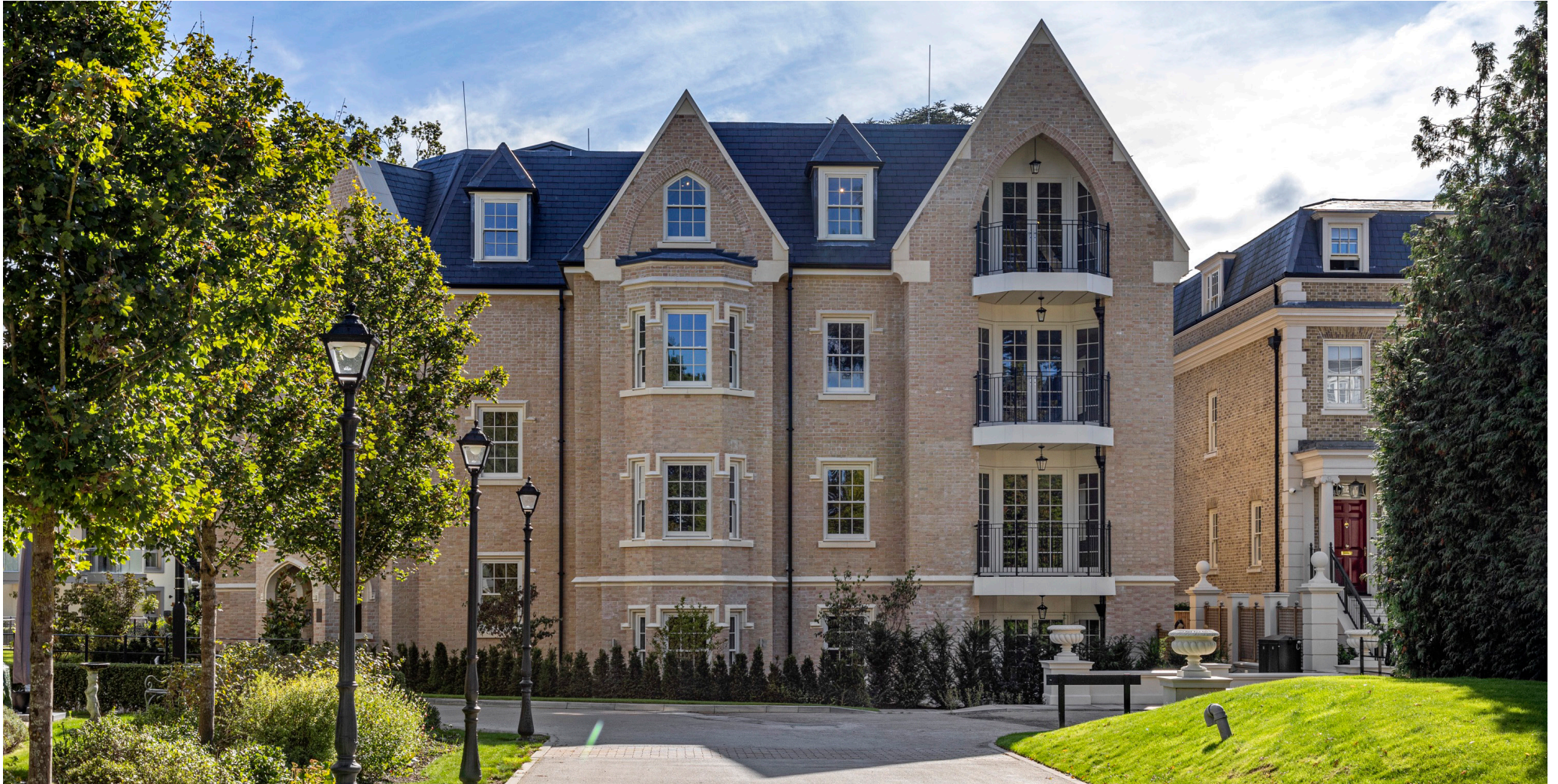
MAGNA CARTA PARK, Englefield Green TW20