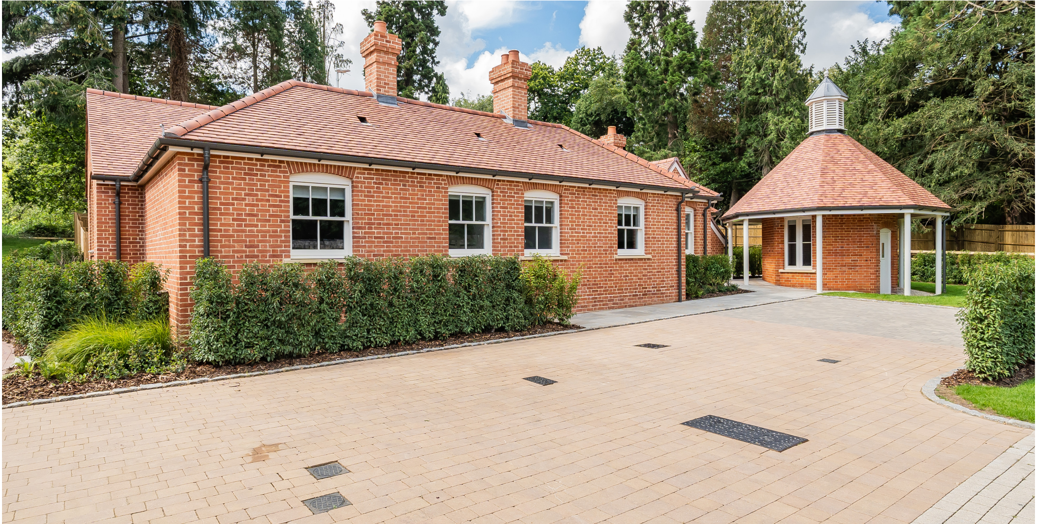
ARCHBURY WALK, Ascot SL5