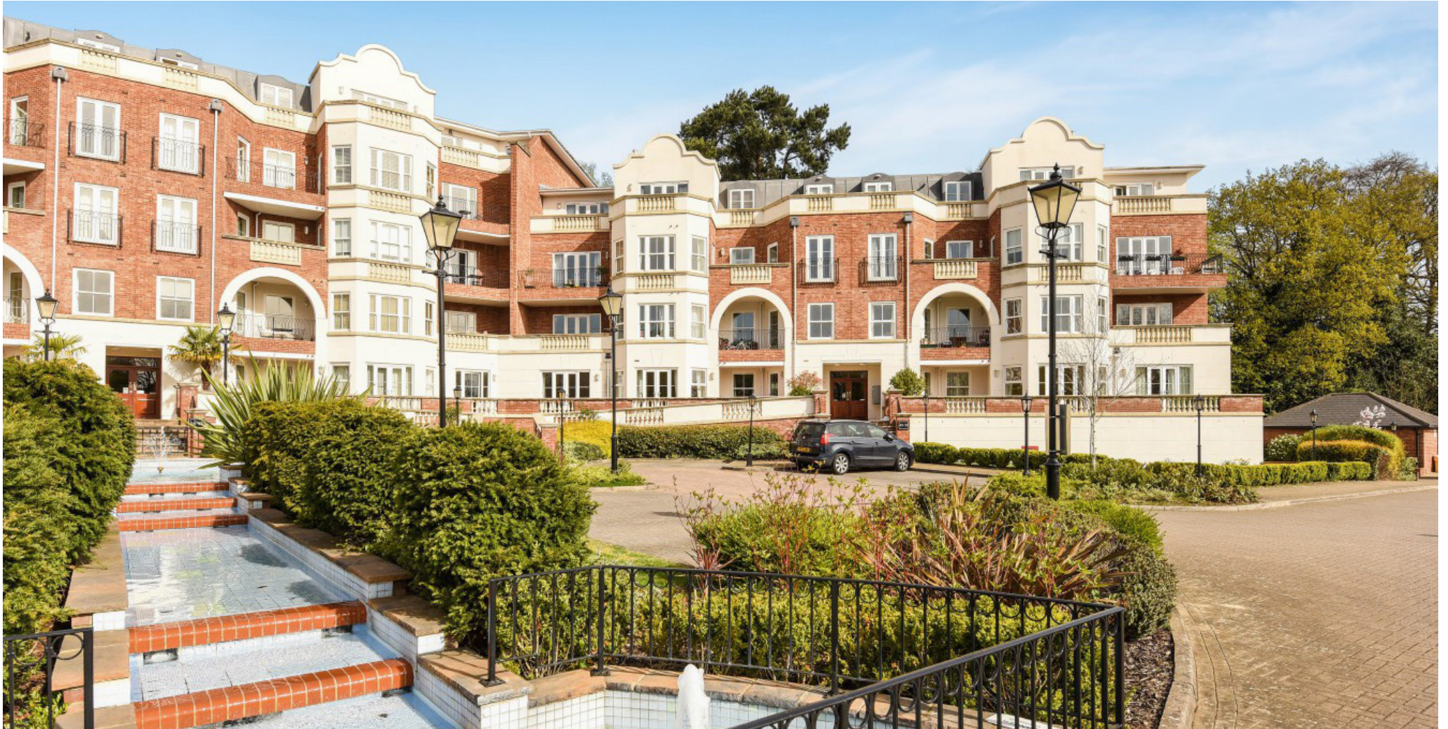
BURLEIGH ROAD, Ascot SL5