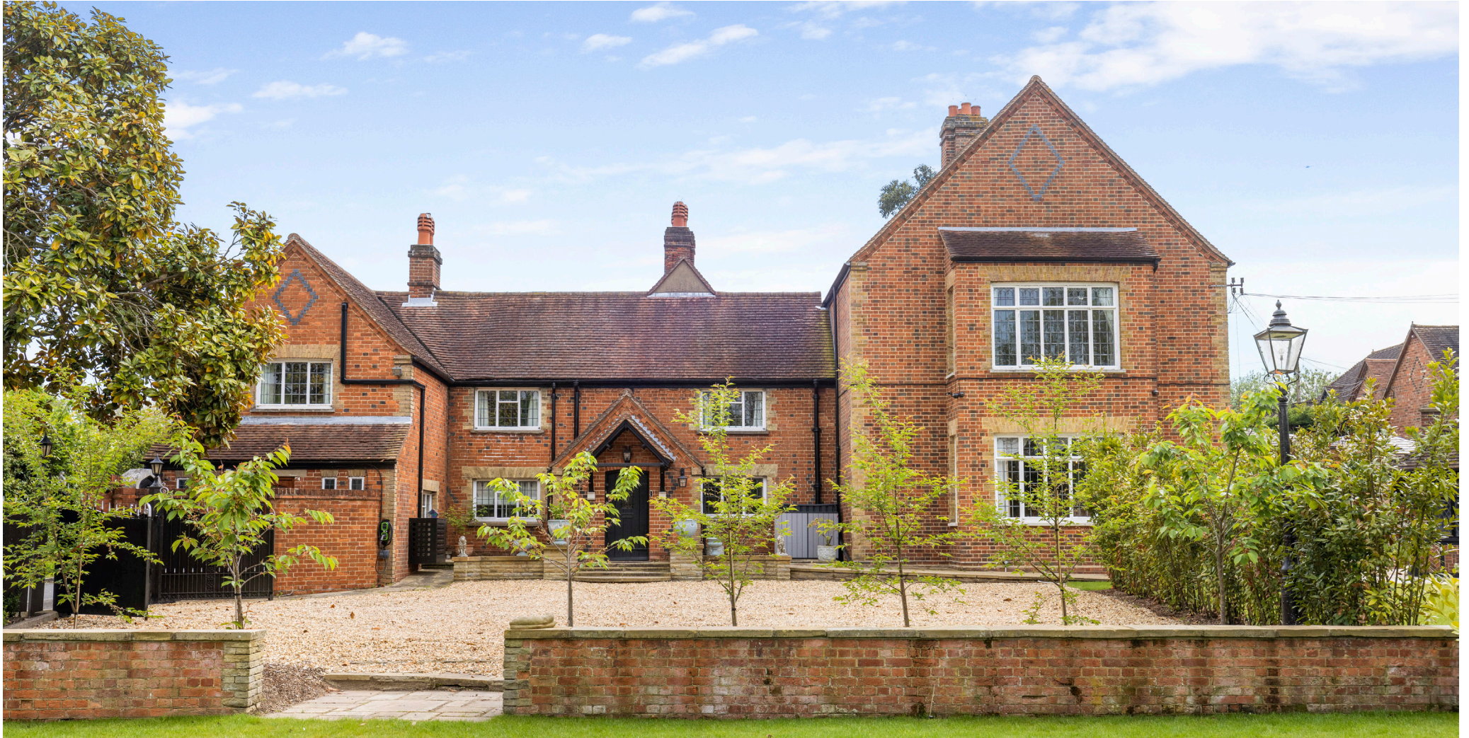
MOSS END, Bracknell RG42