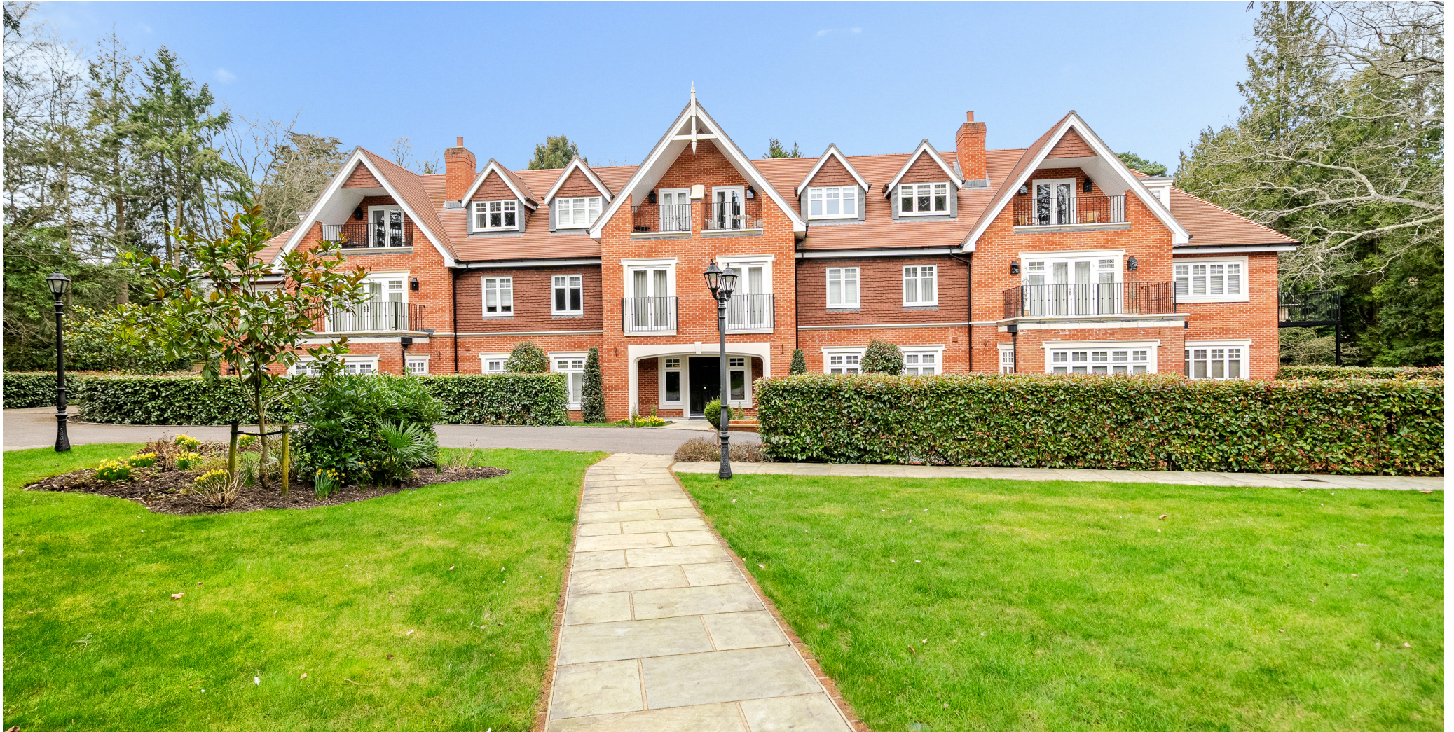
HEATHFIELD AVENUE, Sunninghill SL5