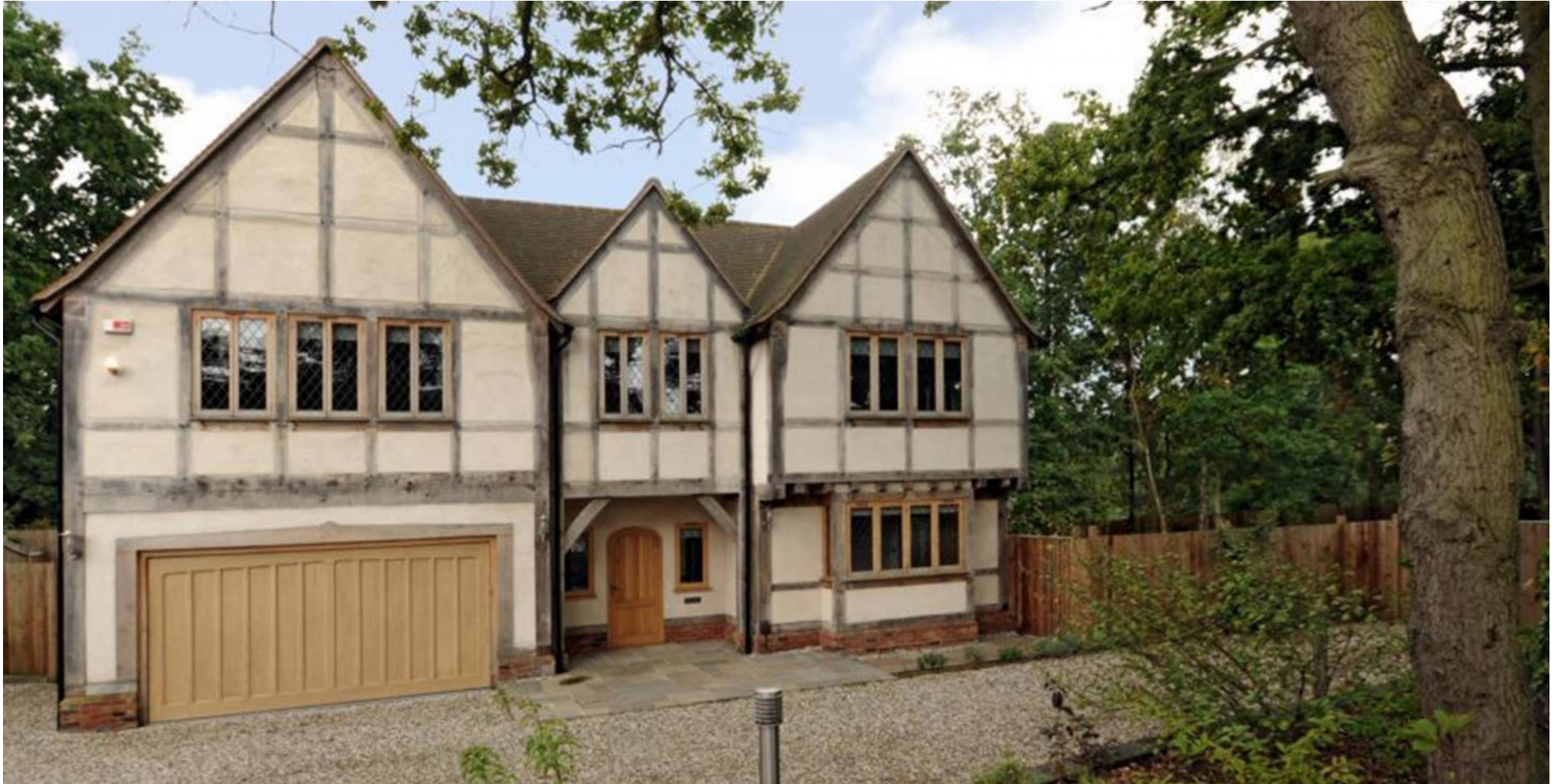
TRUMPSGREEN ROAD, Virginia Water GU25