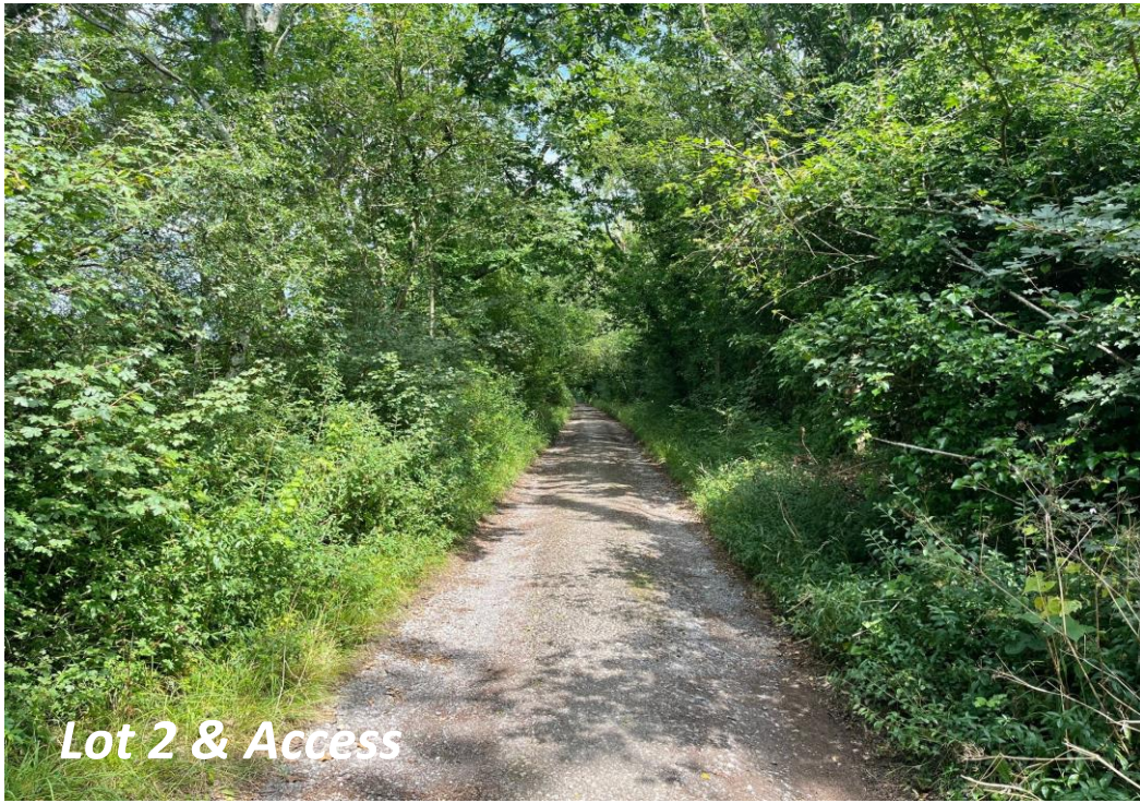
Lot 2 & Access