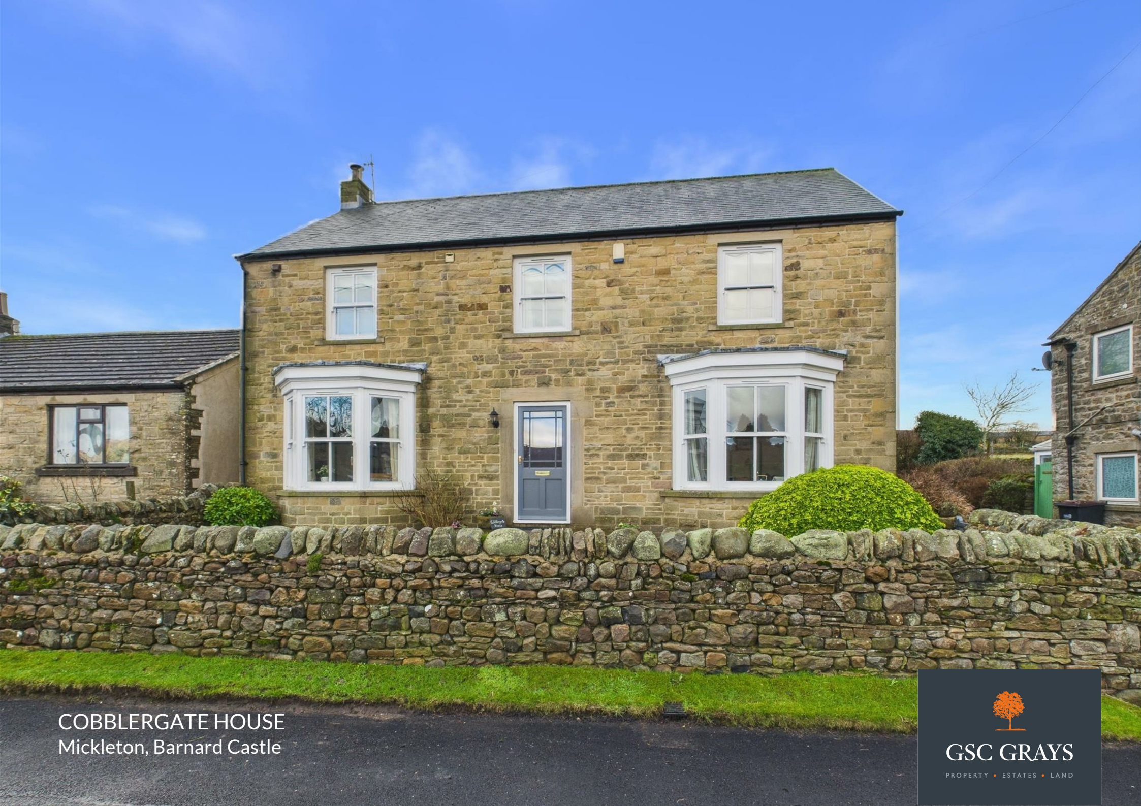
COBBLERGATE HOUSE Mickleton, Barnard Castle