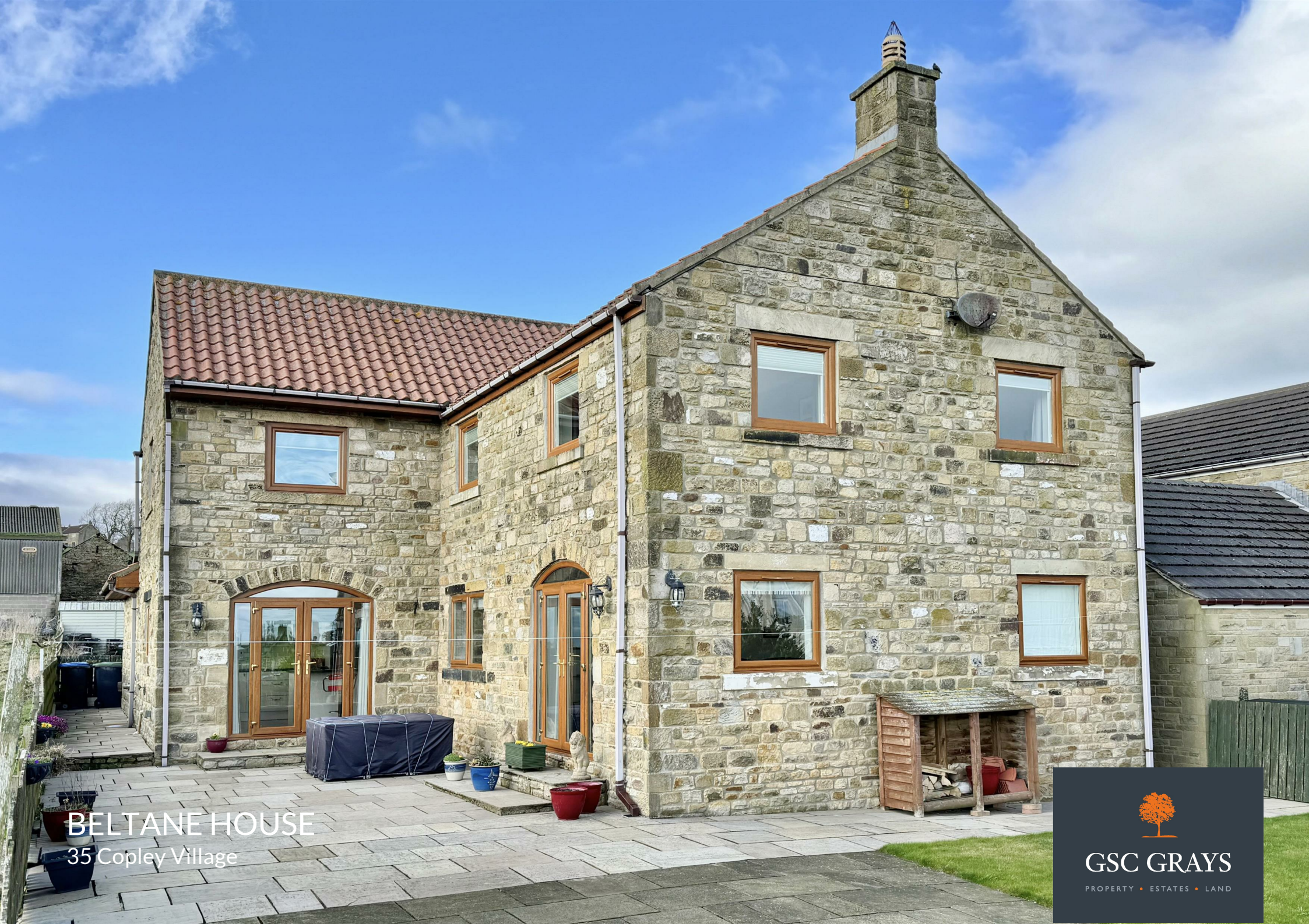
BELTANE HOUSE 35 Copley Village