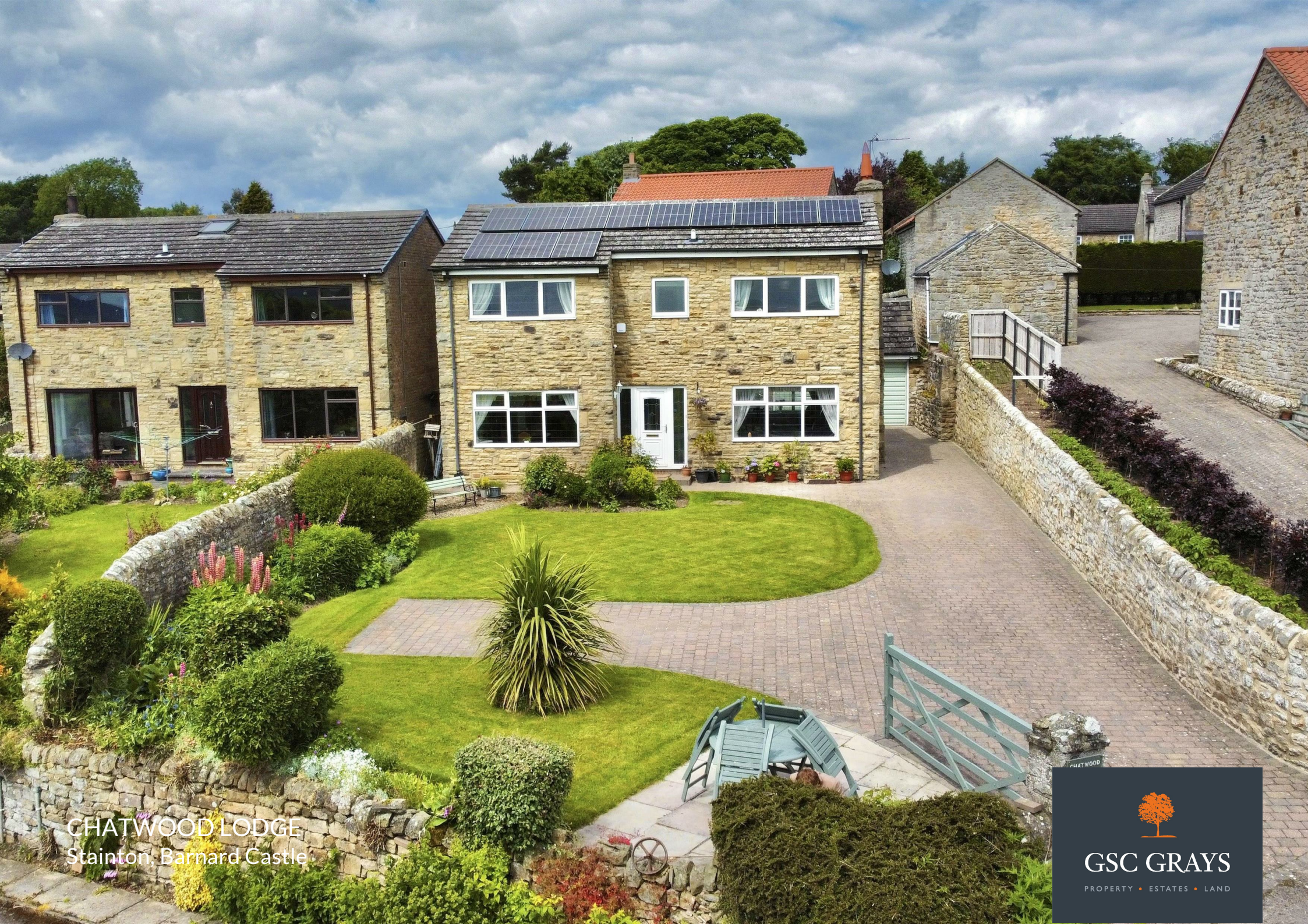
CHATWOOD LODGE Stainton, Barnard Castle