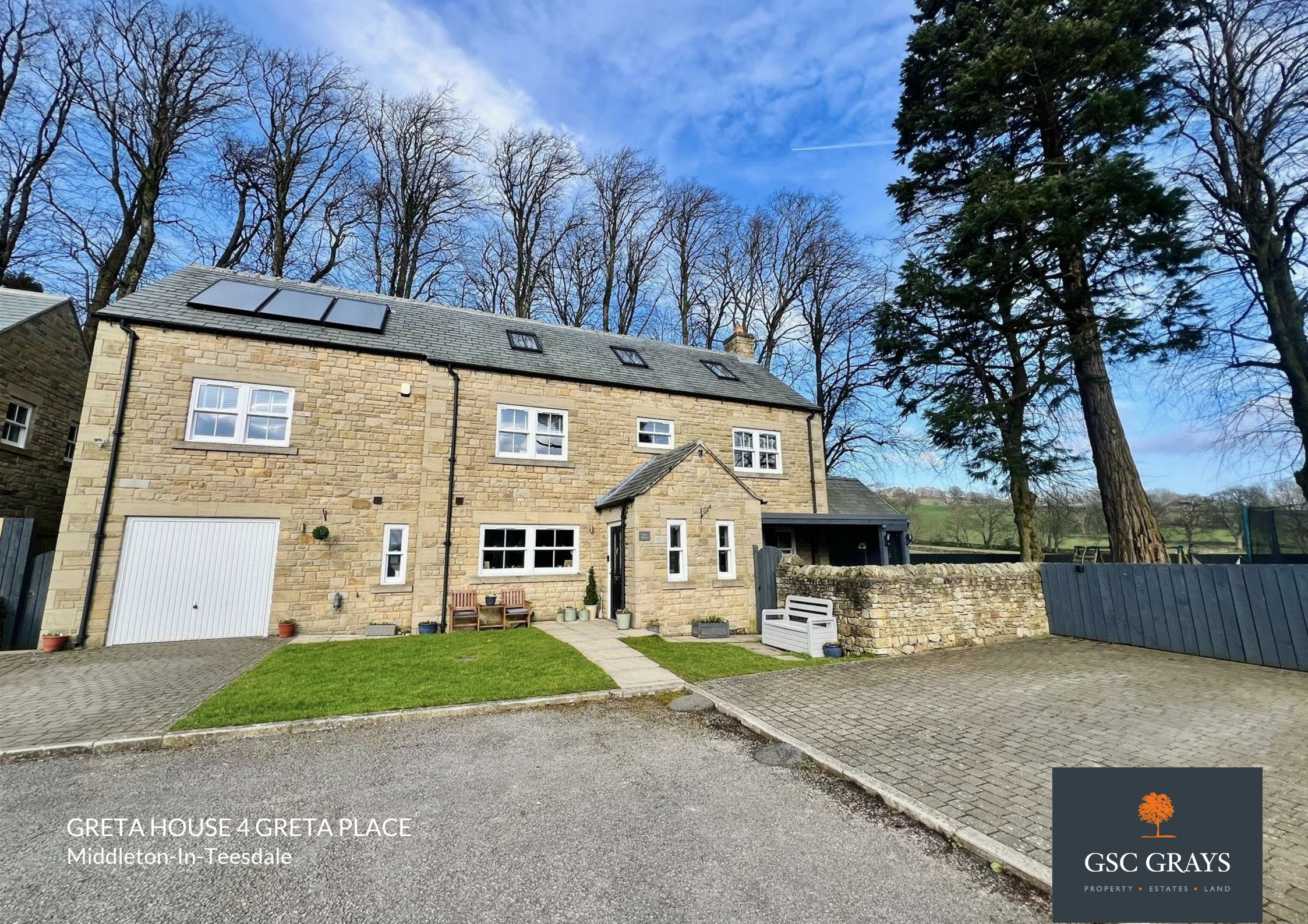
GRETA HOUSE 4 GRETA PLACE Middleton-In-Teesdale