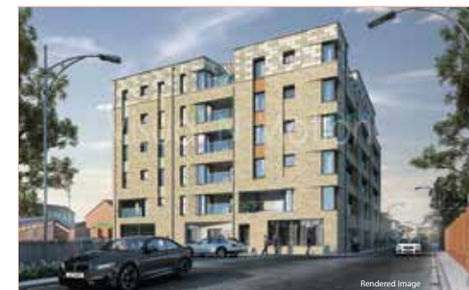
DAVENPORT ESTATES SOUTHALL, LONDON