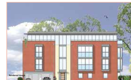
THE MILL HOUSE WINDSOR