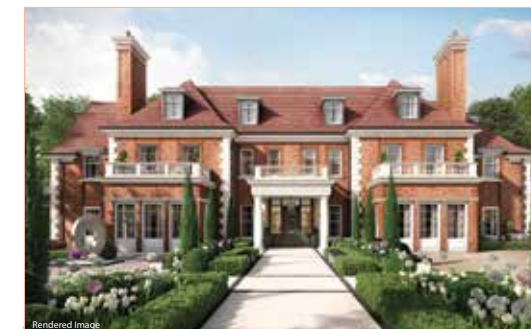
THE CROSSWAYS 26, THE BISHOPS AVENUE, LONDON