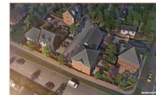
SAVOY CLOSE HEMEL HEMPSTEAD