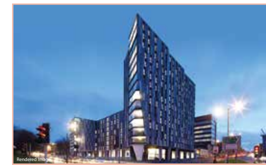
CALICO NORTON STREET, LIVERPOOL