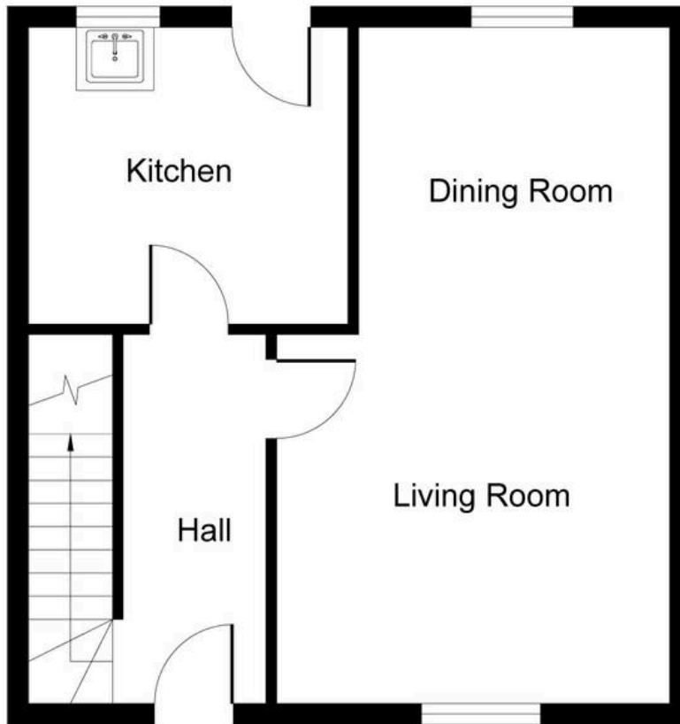
Ground Floor Approximate Floor Area 422 sq. ft (39.16 sq. m)