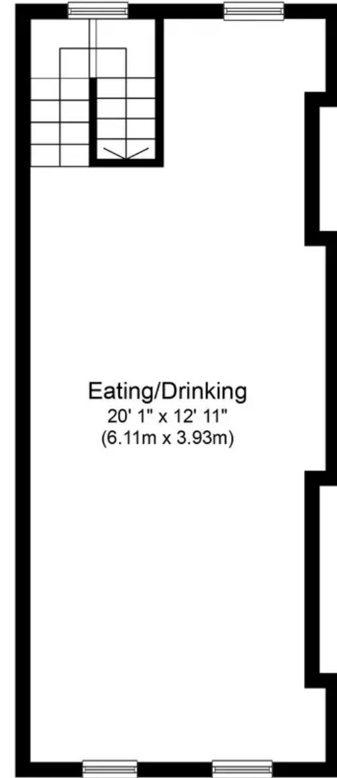
First Floor Approximate Floor Area 417 sq. ft. (38.8 sq. m.)

Whilst every attempt has been made to ensure the accuracy of the floor plan contained here, measurements of doors, windows, rooms and any other items are approximate and no responsibility is taken for any error, omission, or mis-statement. The measurements should not be relied upon for valuation, transaction and/or funding purposes. This plan is for illustrative purposes only and should be used as such by any prospective purchaser or tenant. The services, systems and appliances shown have not been tested and no guarantee as to their operability or efficiency can be given.