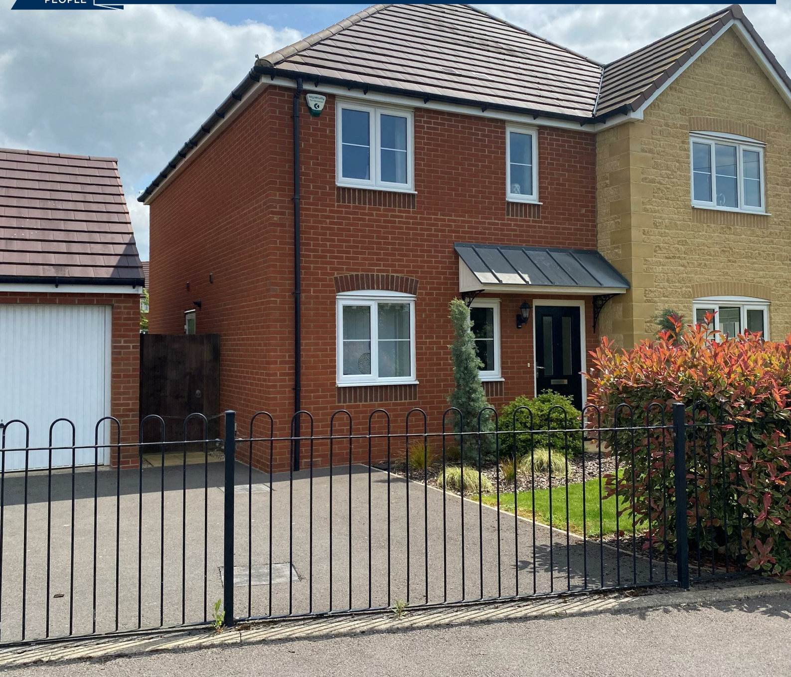
High Penn Park Calne