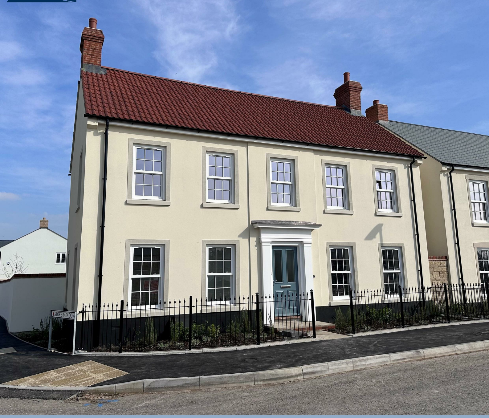
Stoke Meadow Calne